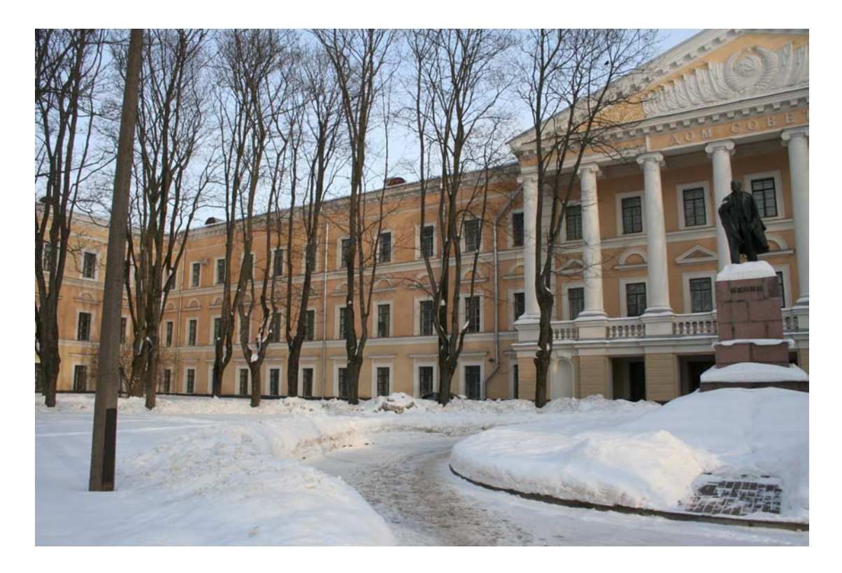
Picture No 4. The main building of the Pskov regional administration.

The administration of Pskov region is located on the Street Nekrassova, Pskov. In the same building, in the right wing reside several federal institutions, including the local representation of the Ministry of Foreign Affairs.