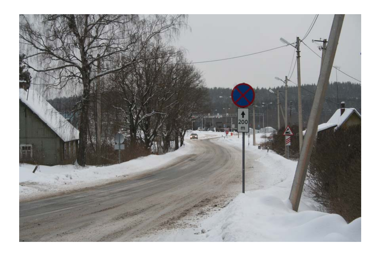
Picture No 6 The Koydula border station, built with assistance from the EU, waits for an upswing in cross-border trade

Psychological reasons are followed by technical/administrative obstacles to practicing cross-border cooperation. The administrations of subnational local units lack the resources to engage in cross-border activities. Beside the lack of funds, the absence of competent personnel hinders cooperation. The study concludes that on the Estonian side, the perception prevails that cooperation with the Russian side means doubling your own efforts, since the partners across the border are rather passive and do not seem to contribute on an equal basis.