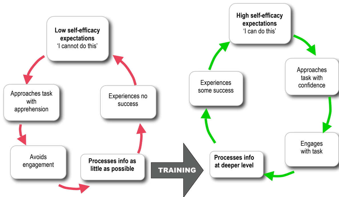
Figure 3: Breaking the 'can't do' circle