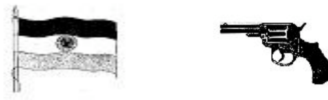
FIGURE 1 Example of picture shown on screen in Experiment 1.

The antecedent was systematically controlled to be the grammatical subject or object in order to balance the design; i.e., we wanted to avoid the asymmetry whereby only subject antecedents or only object antecedents would be used, since such an asymmetry could lead to participants developing a strategy for processing the sentences. There was no theoretical question associated with this manipulation.