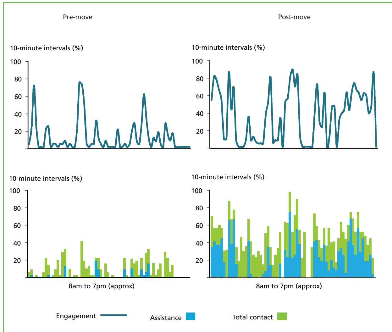
Figure 5: Example of presentation of observational data from Mansell and Beasley (1993)

Where continuous data or a frequent time-sample have been taken over a longer period, it is also possible to examine the pattern of activity. For example, Mansell and Beasley (1993) averaged a 20-second momentary time-sample in ten-minute blocks taken over the whole day to compare the pattern of one person’s day while they lived in an institution and after they moved to staffed housing in the community (Figure 5). In the institution, there was a small amount of help in the early morning, and sporadic contact of other kinds from staff through the day. Activity levels tended to peak on only three occasions (breakfast, lunch, and tea). In the house, interesting activities were far more likely to be spread throughout the day, with much higher levels of contact and assistance from staff to enable the individual to take part.