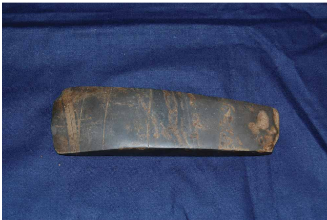
FIGURE 3 A stone axe, described as a 'thunderstone', kara ngkuk , kept by the Semang of the upper Siang River. Donated to the British Museum by B. Cerruti in 1906.

Thunder is believed to have great power (Kelabit: lalud ; Penan: penyukat ), and thunderstones are believed to be a concentrated or petrified form of that power. Kelabit and Penan see the cosmos as suffused with power. Lalud/penyukat is seen as being essentially the same as life; if something has power, it is alive. Not only plants and animals, but also stones, earth and water are seen to be, in some sense, 'alive' (Penan 'to have life [ urip ]');