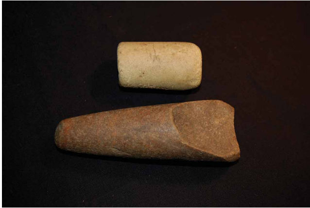
FIGURE 2 Two 'thunderstones' ( batu pera'it ), found by inhabitants of Pa' Dalih at abandoned settlements nearby, and bought from them in 1987 by Monica Janowski on behalf of the British Museum. They had almost certainly been stored in rice barns at the settlements in the belief that they would increase the amount of rice in the barn through their power ( lalud ).

attract pera'it , and until recently the use of these in house-building was avoided. Such stones are said to be batu pera'it ('thunderstones'), because they derive from thunder. Many informants also said that they are 'teeth of thunder' ( lipen pera'it ), echoing the views of other peoples in Sarawak, Sabah, Peninsular Malaysia and in the Naga Hills in Burma (e.g. Evans 1913; Hose and McDougall 1966: 11; Hutton 1926).