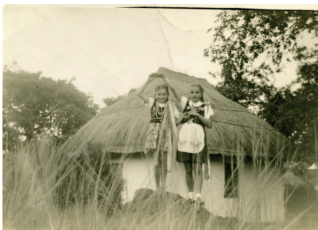
FIGURE 3 Little girls in Polish costumes outside the mud huts which were their homes at Lusaka camp in Zambia. (Color figure available online).

Michalina Płuciennik, and Irena Miluska all remember that these were made communally at akademia patriotic performances on occasions such as 3rd May, Polish national day; they remembered that they were otherwise not made often, as they required scarce flour. In Poland, these had been simple everyday fare; in exile, they became iconic, special, requiring resources which were not easily available. The preparation and consumption together of foods like these on special occasions meals came to symbolise, outside Poland, the kinship of all Poles, as one big family.