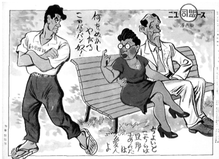
Figure 4. Text beneath the park bench: “This here [Ashida] is my danna (husband); you’re my lover!” Text between prostitute and younger man: “Just who is this whore (pan-pan yakko) jacking off.” Katō Etsurō. Dōmei nyūzu mangahan dai nijūkyū ban. 36cm x 26cm. PB0814: 20 August 1948.

Within a few weeks of publishing his first “Boogie Woogie” panel, Katō expanded the scope of his attacks on the politically conservative Ashida Government to include its archrival, the Japan Socialist Party (JSP). Published in the 20 August edition of the Comic News, figure 4 portrays the JSP as a plump woman whose face resembles that of former socialist prime minister Katayama Tetsu. Katō illustrates Katayama wearing a red dress (identifying Katayama in the text across “her” lap as the Socialist Party), red high heels, and red lipstick. The cross-dressed Katayama (who here represents an odd twist on the eroticized female form) is seated on a park bench beside Prime Minister Ashida Hitoshi. 79