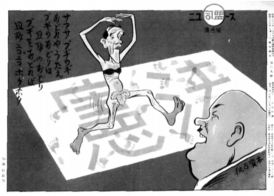
Figure 5. “Come on and dance and sing the boogie woogie / The boogie is [your] husband’s/patron’s dance / and your husband/patron won’t frown when you dance the boogie.” Katō Etsurō. Dōmei nyūzū mangahan dai nijūkyū ban . 36cm x 26cm. PB0816: 20 August 1948.

In the panel reproduced in figure 5, from the same issue of the Comic News ,