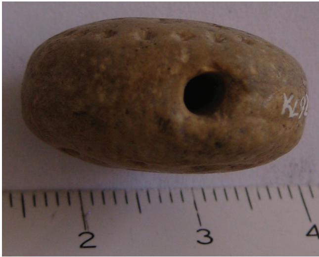
Fig. 1: Transverse view of the button seal KL 92-5