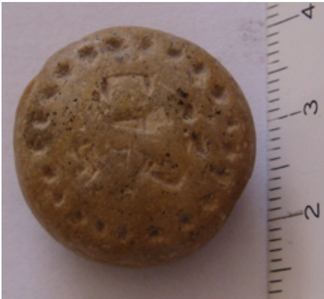
Fig. 2: KL 92-5 Side A.