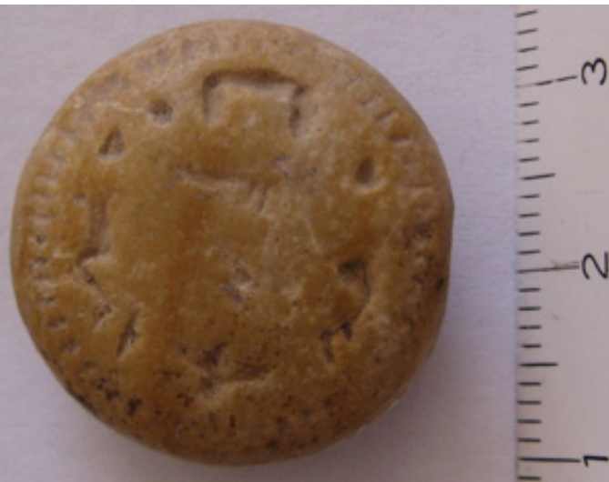
Fig. 3: KL 92-5 Side B.