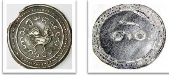
Figure 9. Tin coin with rooster and 'ta-weh' on the reverse; 6-7 cm dia, Than Swe Collection.

Most tin coins, however, have a central lotus-animal- naga motif with three lower rows of dots or wavy lines. 100 Writing is found on the reverse of most coins; the script is modern Myanmar reading Maha-thukan-nagaran or city of great happiness.