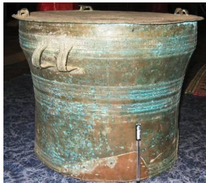
Figure 5. Alabaster image of Thagyarmin as sima , Thit-she-bin Monastery ( c. 60 cm, left); Heger 3 'frog' bronze drum, Shwetaung Monastery ( c. 45 cm ht, right)