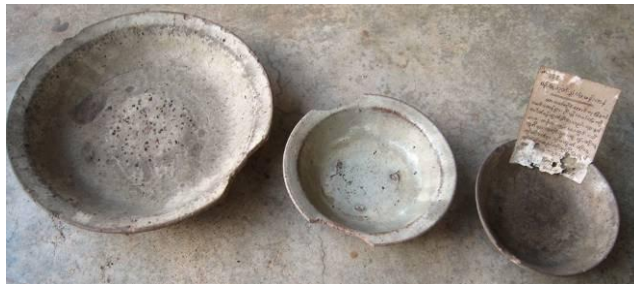
Figure 12 Green glazed bowls from Maungmagan (15, 18 and 28 cm diameter), Hpaya Gyi Museum, from land of U Pyo Leh.