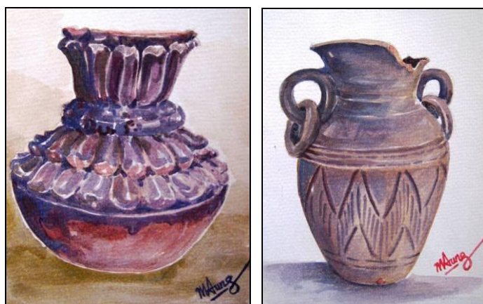
Figure 1. Glazed wares from Sin Seik, circa 15-17 th century CE, paintings by Myint Aung, Ministry of Culture, June 2010.

This report argues the contrary, that Dawei resilience in the face of continual threats sustained a local cultural personality that has survived until the present. The question is addressed by first classifying the sites of Dawei into four cultural zones and then discussing the extraordinary range of artefacts from these zones by material. 3 This is preceded by a chronological summary to illustrate the often turbulent history and local chronicles.