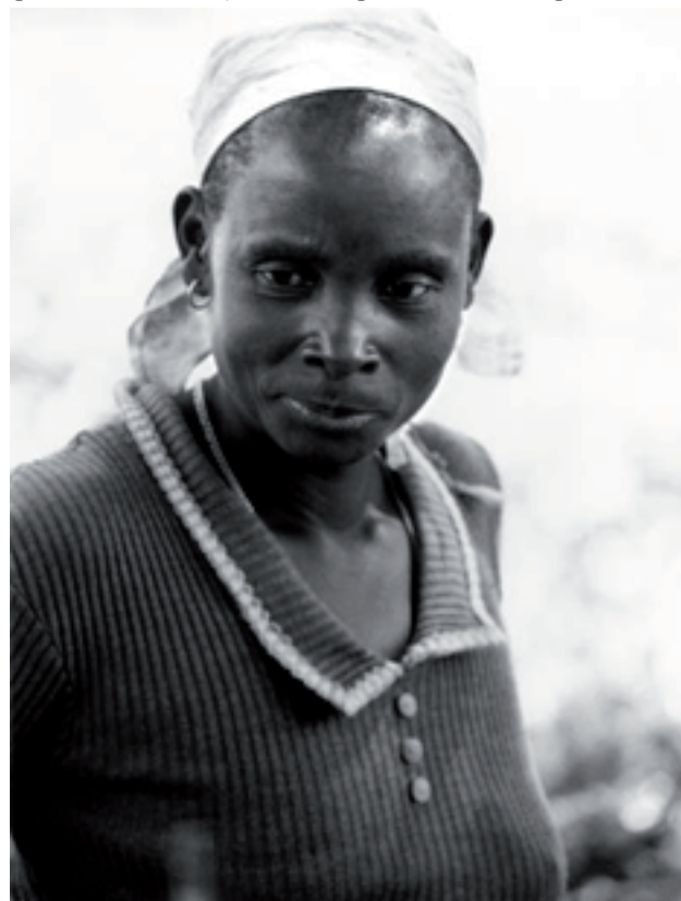
Respondent for life history

Employing such a range of methods provides much more information than that provided by standard household surveys. The most common survey, the Living Standards Measurement Survey, developed by the World Bank, has several weaknesses. For example, the employment sections of such surveys are very brief and typically ask about only the last week of labour activities. This approach is unsurprising since such surveys focus on collecting a vast array of statistical information on household characteristics and are most concerned with consumption data for poverty estimates.