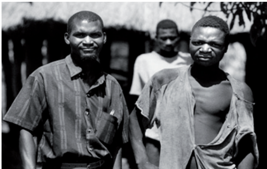
Wage workers in rural Mozambique

The MRLS also reveals significant differences in deprivation among female workers themselves. Such differences show up in their possession scores, their own educational level and that of their children, their incidence of early marriage, and the type of job they are able to secure in the labour market. These results highlight the degree of heterogeneity that exists among both poor women and men.