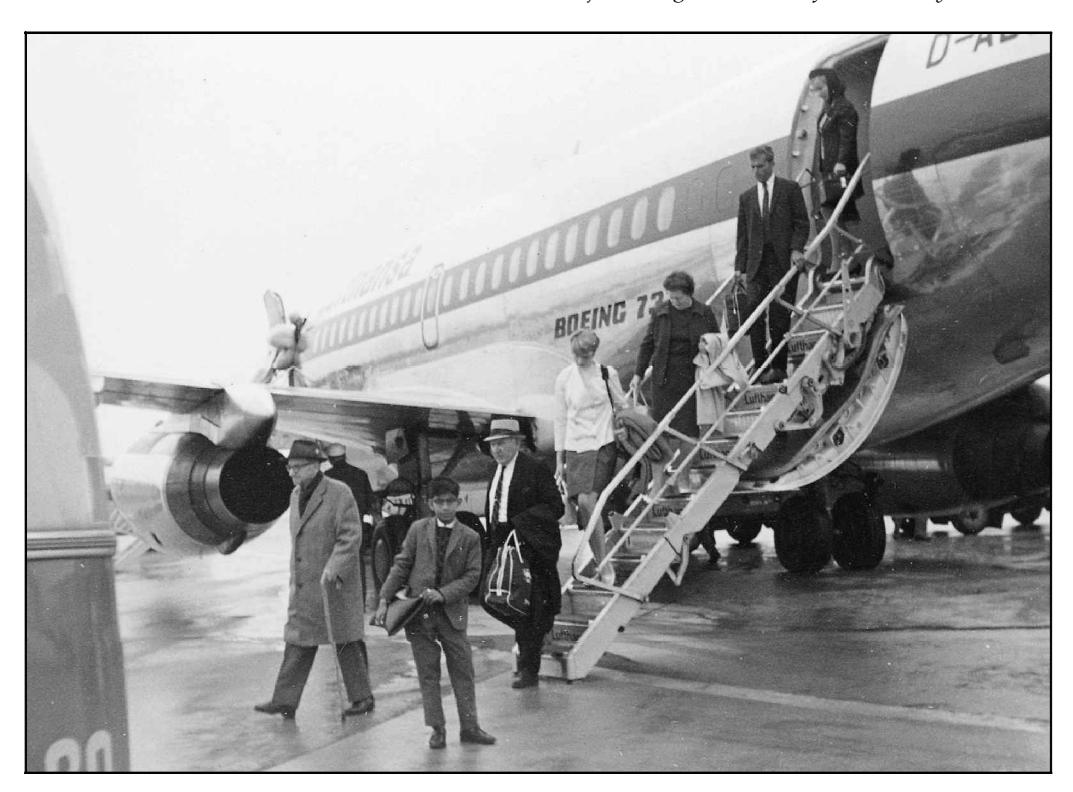
Above Arriving at Heathrow from Kenya in 1969

This is, according to a Gujarati teacher living in Wellingborough, how migration from India to Africa began. It reminds us that, for Gujarati women who, unlike men, nearly always move residence on marriage, migration from their parents' home is inevitable. The story also draws attention to the fact that if women's reputations are ruined, they can be forced into exile. Restriction on their mobility before marriage protects their own and their family's reputation, which is necessary not only for their own marriage prospects but those of other family members as well. It is already clear that gendered cultural rules and practices very directly shape migration.