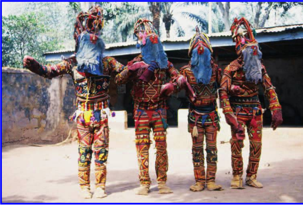
7 Okue-ekwe masquerade of Umueze performing for the last time at Uga. March 4, 1992.