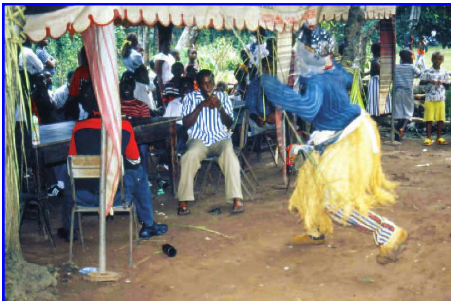
21 Masquerade at Oka confronting but also dancing with a flute musician, who is playing the music associated with masquerade performance. August 21, 2006.

Secondly, entertainment masquerades of the youth are a part of cultural repertoires that coalesce youth as a category in opposition to older generations in ways that challenge or at least subvert the authority of elite, middle-aged men who have taken up Pentecostalism and now reject masquerade fellowship as a potential avenue of social advancement. Masquerade now offers an alternative mode of sociality centered on localized youth identities (see Nunley 1987 for an example of fractured and contested youth masquerade in the 1970s in Freetown, Sierra Leone) rather than defining a wider collective set of intergenerational relations between male age-sets at community level (d'Azevedo 1973, Yoshida 1993, Ottenberg 1972, 1975). Furthermore, in defining elite relations within the town, the at-home youths define a local-