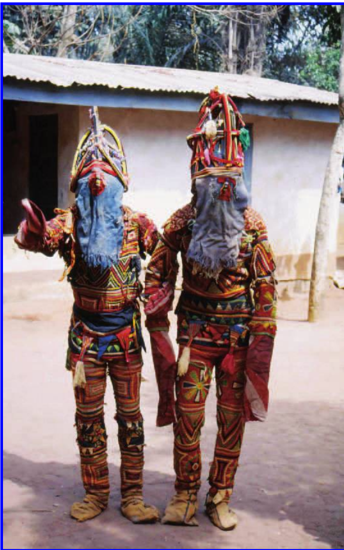
8 Okue-ekwe masquerade of Umueze performing for the last time at Uga. March 4, 1992.

and individuals from outside Uga. They are also metaphysically charged with potent medicines that center on the competitive arenas in which they publicly perform. Most of these masquerades are associations that come together in fellowship to practice masquerade within and between the various Uga villages and also to compete against other towns' masquerades. On occasion they also perform at festivals organized by the Aguata LGA administration or at Anambra state festivals (for a description see Reed 2005).