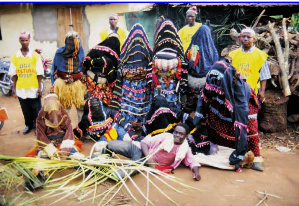
18 Masqueraders at Oka with the older generation of practitioners (organized as the Uga Cultural Group) at the advent of masquerade during the new yam festival, August 19, 2006.

eze, which the Igwe also heads. On the day the prospective titleholders attended with their supporters to be given their newly created titles, these appointments were cancelled due to a belatedly raised constitutional problem. The issue was that if any Igwe died without a male heir, the internal government of Uga would shift to the (about-to-be-appointed) chief at Oka, the Ikenga of Uga, as the second-ranked community. This would in effect permanently transfer authority from the Umueze community, undermining the historic political precedents through which Uga was constituted. It became the crucible for an already ongoing debate in Oka as to whether it should secede and become an autonomous community and so gain direct access to state resources. This position garnered popular support throughout the community of Oka.