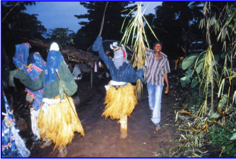
5 Masqueraders in procession at the ending of the Oka new yam festival, having removed the new palm leaf that four days earlier had been tied to a tree to allow masquerade to take place in public at Oka. August 22, 2006.