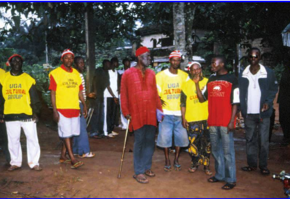
17 The Onye Isi Mmonwu in red (with his Uga Cultural Group) adjudicating a dispute that had arisen between an Oka inhabitant and a masquerader. August 22, 2006.