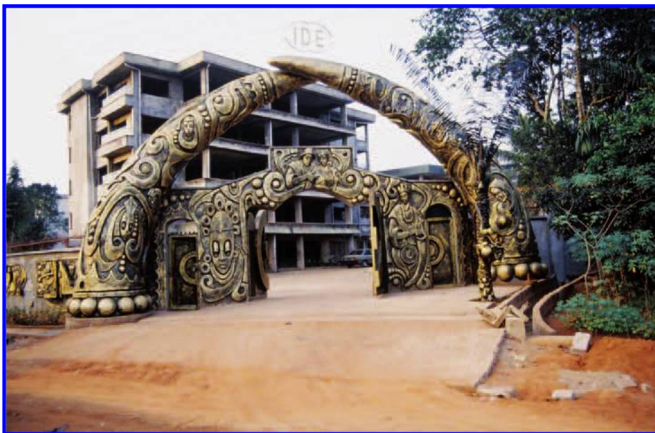
4 Decorated entrance way to the house of a wealthy businessman at Uga who works at Onitsha. December 30, 1991.

Only males can be initiated into masquerade, usually during their time within the youth age-set. Every male has the right to join, although not everyone decides to take up masquerade practice and, indeed, there has been local opposition to it since the advent of the Anglican church circa 1914. Public performances are spatially gendered, with women keeping their distance due to the inherent metaphysical and disciplinary dangers of masquerade. Up to the Biafran War (1967–1970) there were easily identifiable masquerade houses within each village, where communal masquerades were safely stored. These are no longer easily visible, although temporary structures and locked rooms in village community halls serve that purpose today in some communities. In addition, some masquerades, owned by a particular individual or family, are stored secretly within family compounds. There were a wide range of masquerades found in Uga along with the associations which supported them. They were the ave-