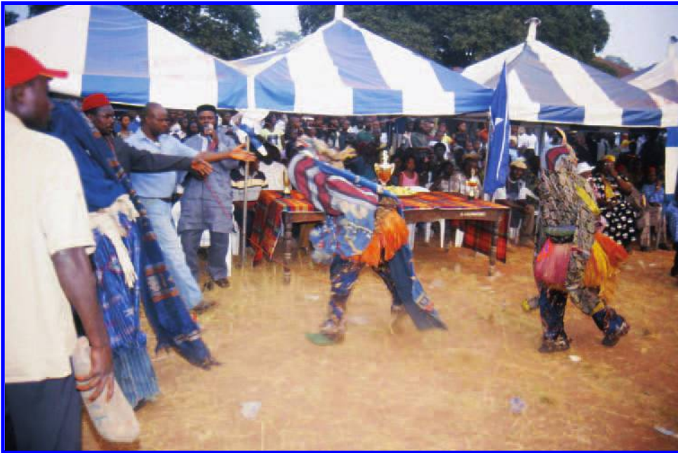
20 Masqueraders competing for the prize cup at Amesí (a neighboring and adjacent community to Uga) who are acknowledged by an older generation of practitioners. January 1, 2007.