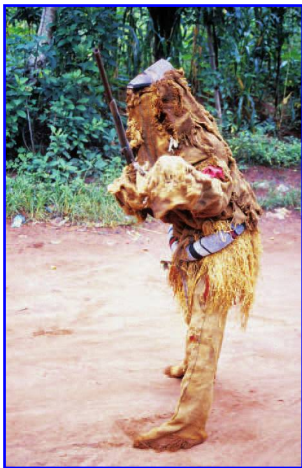
1 Ajabu is a solitary and unpleasant masquerade, historically associated with the fight against a British punitive expedition that occupied the town in 1916. Uga, July 19, 2005.