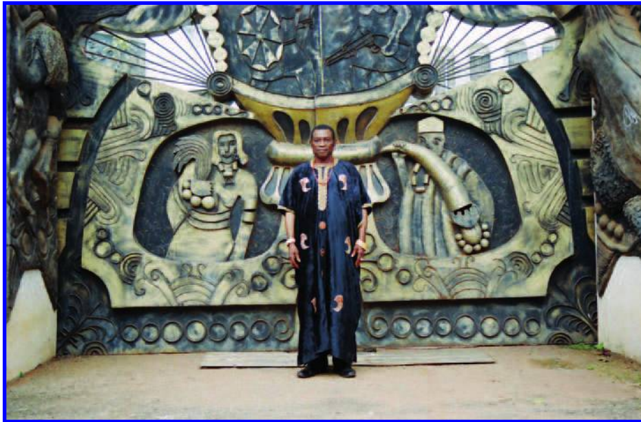
19 The Ikenga of Oka in front of the decorated gates that highlight his elite status and prestige. August 19, 2005.