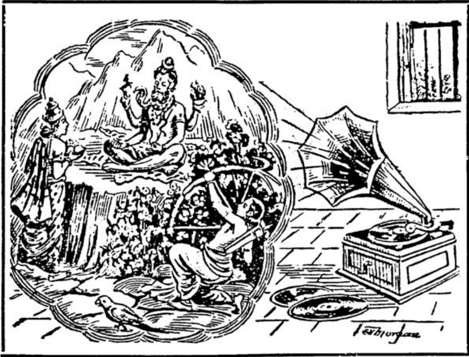
Figure 5. This image accompanied a gramophone record review in a weekly arts criticism feature, aadal paadal (Song and Dance), written by Kalki R. Krishnamurthy and published by the leading Tamil variety magazine. Source: Ananda Vikatan , May 20 1934, 28.

the other gramophone companies quickly responded in kind with their own drama sets, creating something of a musical fad. In a matter of months, these drama sets became the most prominently advertised of all south Indian gramophone offerings. Considering that drama sets encouraged the sale of as many as ten records at a time, the record companies appeared to be especially keen to promote this new line of musical products.