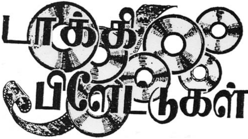
Figure 7. In Tamil, this reads “Talkie Plates.” This is the headline title for a magazine review article of film song recordings, which heralds the musical partnership between the gramophone and cinema.

something of a passing fad whose heyday lasted for less than a decade. 22 Their prominence as a gramophone offering diminished and was eventually replaced when Tamil film songs emerged as the best-selling popular records during the late 1930s (see Figure 7). Instead of working in competition with each other, the recording and film companies learned to work together, and they laid the commercial and institutional foundation for producing and sustaining the music of Tamil cinema, both as a filmic necessity and as an accompanying mass culture of music.