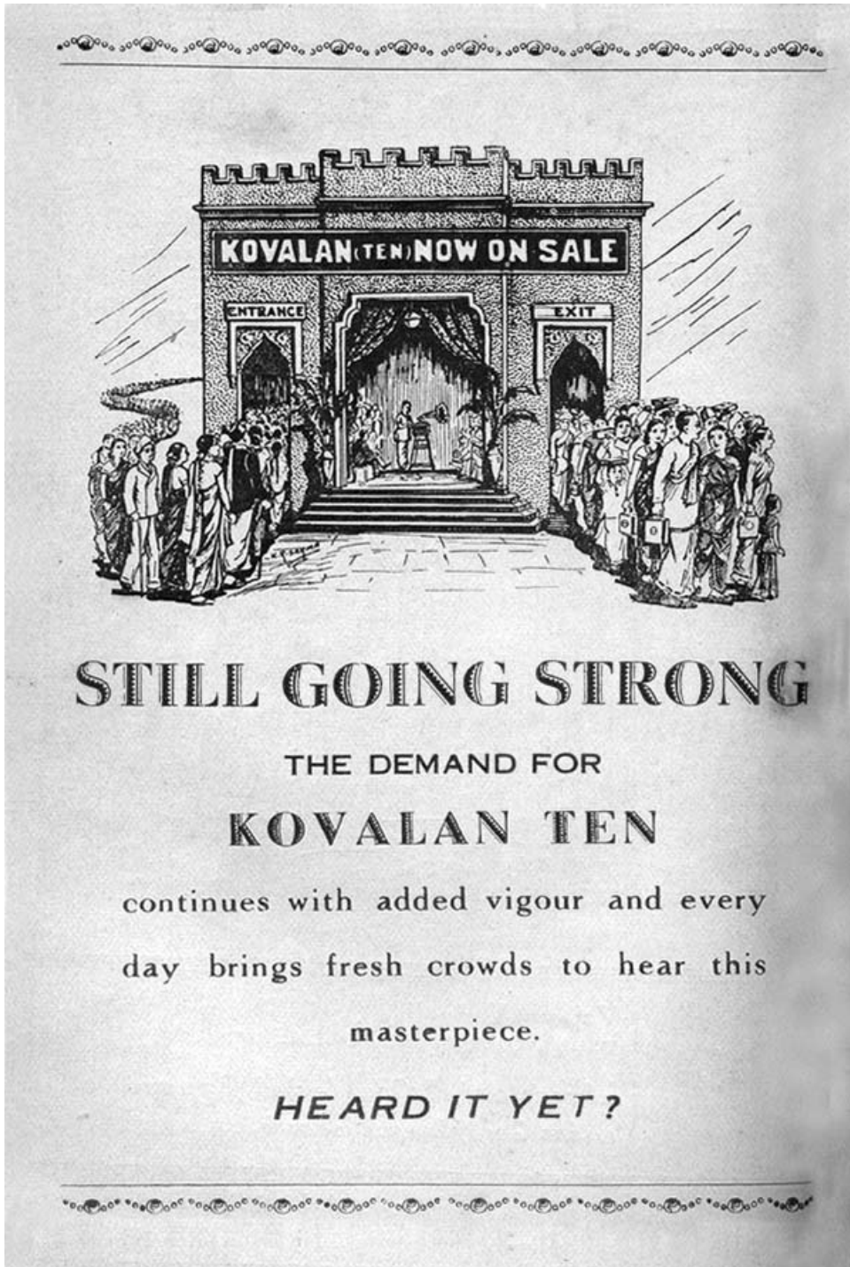
Figure 4. An advertisement for Kovalan , Saraswati Stores' first drama record set. [Located with page 14]