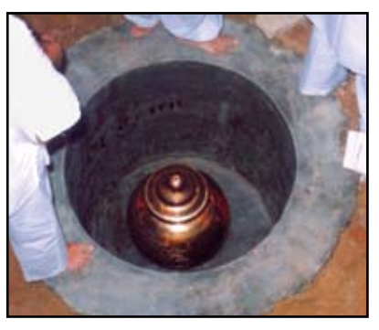
Fig.1 Entombment of the asthi kalaśa, or bone vessel of ĀcāryaTulsī, Ācārva Tulsī Śakti Pīth, Gangāśahar 21 April 2000

traditions.<sup>4</sup> (Fig. 7) Hence, the initial hypothesis that the contemporary Jain cult of bone relics functions either as substitute or as a prototype for image-worship had to be amended. Modern Jain relic shrines are evidently not only constructed in aniconic Jain traditions as functional equivalents of temples. It also emerged that the Jain cult of relics is not only a feature of lay religiosity, but usually deliberately fostered by mendicants seeking to perpetuate the influence of their deceased teachers through the construction of stūpas and the distribution of ashes from the funeral pyre and other memorabilia.