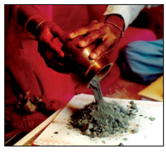
Ashes and bones of Ācārya Tulsī, preserved by a family in Gaṅgāśahar 15 December 2002