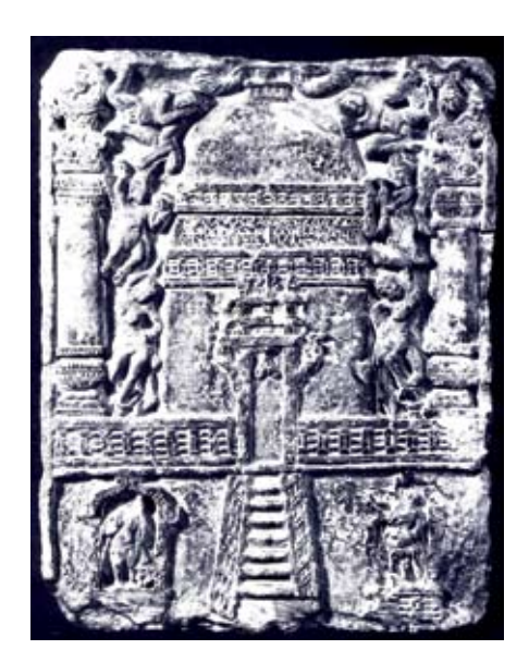
Fig. 8 Jain stūpa on Āyāgapaṭa relief in Kaṅkālī-Ṭīlā