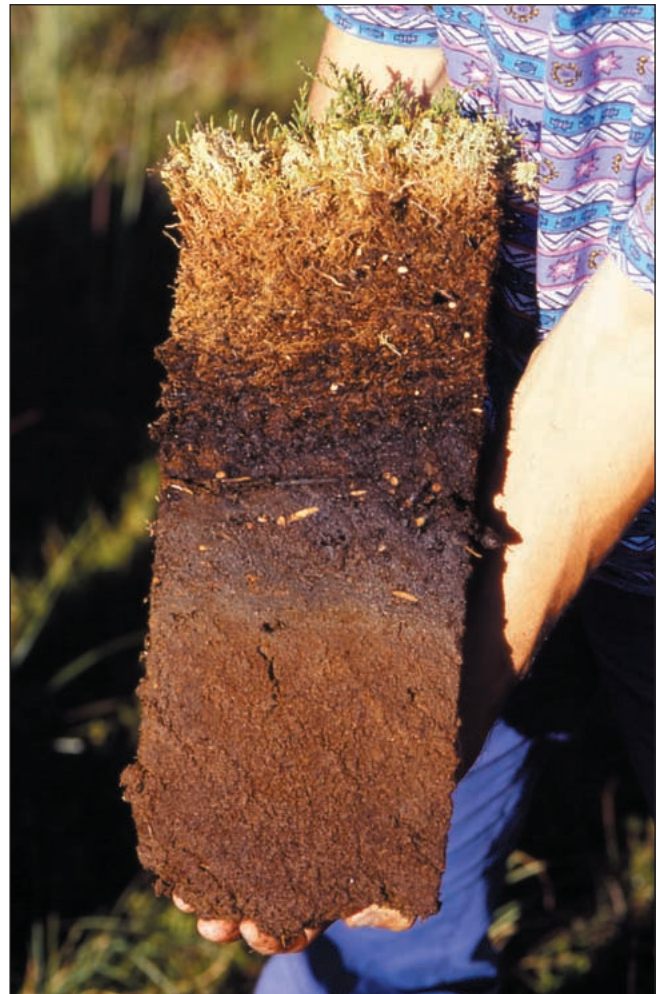
Figure 3. Peat profile taken on a mined peatland where successful regeneration has occurred through initial colonization by the moss Polytrichum strictum and later recolonization by Sphagnum fallax . The former peat surface is visible at the bottom. The dark brown layer is the former peat surface that has undergone partial decomposition under oxygenated conditions. The less decomposed, lighter brown peat with recognizable plant remains lies above, and the living mosses and vascular plants are at the top.

Of the active peatlands lost over time in the non-tropical world, 50% has been to agriculture, 30% to forestry, 10% to peat extraction, and the remainder to urbaniza-