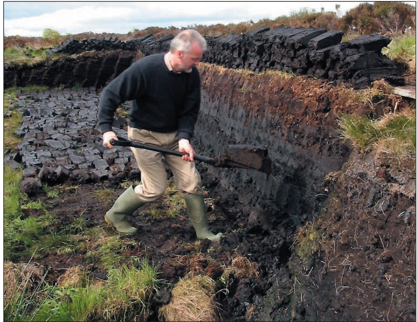
Figure 5. Traditional peat cutting in Scotland. This kind of relatively low-impact exploitation of peatlands may increase biodiversity by recreating transitional habitats.

In countries such as Switzerland, where the total surface area of remaining peatlands is small, several rare or endangered species now benefit from secondary habitats created by former peat extraction activities. These include the peat mosses Sphagnum affine , Sphagnum contortum , Sphagnum fimbriatum , Sphagnum teres , and Sphagnum warnstorffii , which are restricted to fens or often found in secondary bog vegetation (Feldmeyer-Christe et al. 2001), as well as dragonfly species such as Leucorrhinia pectoralis , Aeshna subarctica , Lestes virens vestalis , and Coenagrion hastulatum . The latter are found in the transitional habitats that often develop in peat extraction ditches (eg Sphagno-Utricularion , Caricion lasiocarpae , or Magnocaricion plant communities), but are absent from the late-succession stages of bog development (Delarze et al. 1998). In Sweden, it was found that the regional diversity of peat mosses had been increased in old hand-cut pits after spon-