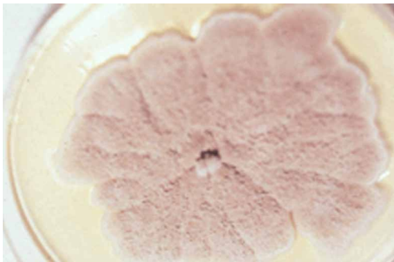
Figure 2. Corn meal agar showing the seven days growth of Scopulariopsis colonies.