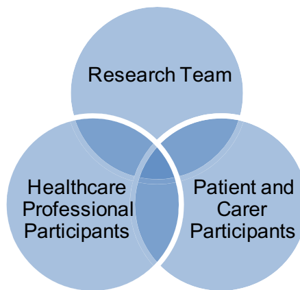
Figure 2. Collaboration Two: data collection.

There were many examples of their range of perspectives in cycle one. For example, one patient who had just learned what her surgery would involve said: