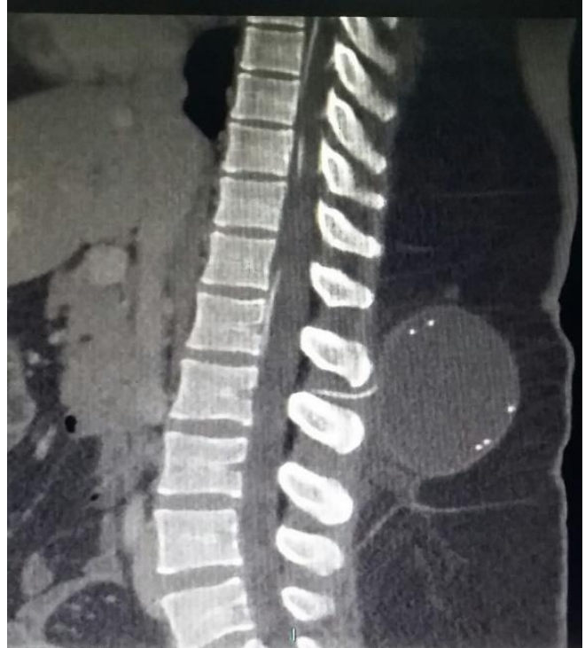
Fig. 3: Well circumscribed cystic lesion is seen in the subcutaneous tissues of the back, posterior to L1 and L2 spinous processes measuring 6.4 \times 5.2 \times 7 cm in antero-posterior, transverse and craniocaudal respectively, with the shunt tube coiled within its cavity.