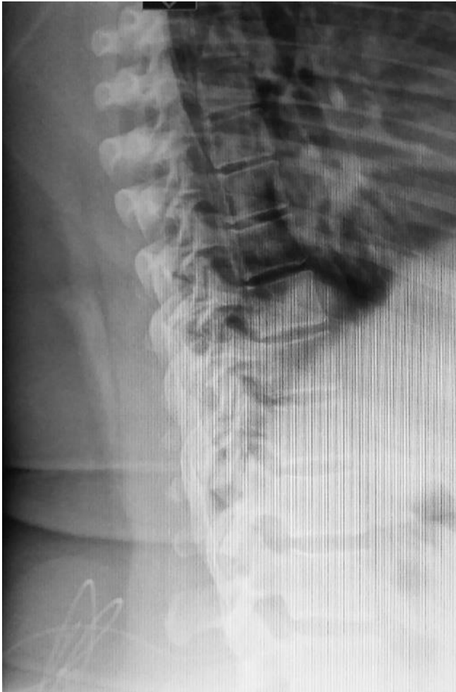
Fig. 2: X-ray dorsolumbar spine lateral view showing coiled shunt tube in posterior lumbar subcutaneous cystic space.