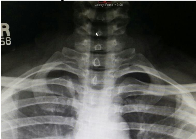
Fig. 1: X-ray cervicodorsal spine AP view showing tip of the proximally migrated LP shunt reaching up to Cervical 6 vertebra.

complication. Postoperatively she remained well and was later discharged in a stable condition.