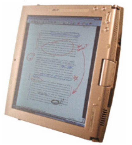
Figure 4: Acer TravelMate 100 running Microsoft Windows XP Tablet PC Edition and Internet Explorer with Callisto plugin.

During the study, we ran Callisto on an Acer TravelMate 100 running Microsoft's Tablet PC operating system ( Figure 4 ). This machine is a laptop computer with a pen input digitizer integrated into its screen. The screen swivels