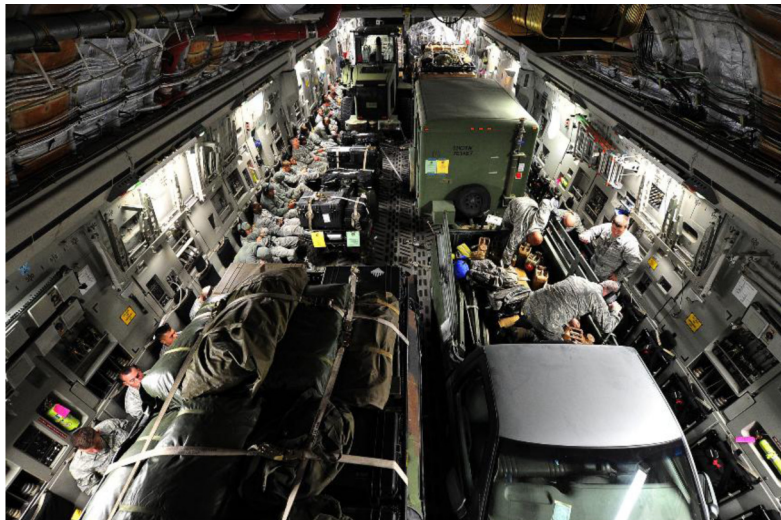
Plate 1. Wasted vertical space example

Thus, the purpose of this study is to examine multiple aircraft load planning techniques to determine which, if any, may offer significant opportunities for load planners to maximize the use of aircraft cargo space and ultimately save taxpayer money. The remainder of this article is structured as follows. In the next section, we identify and describe eight aircraft load planning techniques that we evaluate. We then provide a review of the methodology to include our assumptions and limitations. We present the results for each of the aircraft load planning techniques and conclude with a discussion of the implications of the total savings that could be achieved using these techniques.