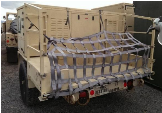
Plate 3. Empty vehicle bay with adjustable netting

pallet's content listing, then it would be difficult to determine if the pallet can be broken down or if it must remain intact as one solid piece of cargo.