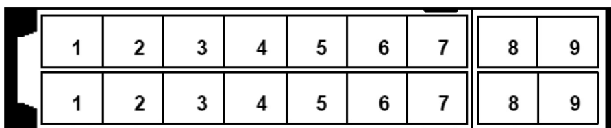
Figure 2. C-17A in and LGS configuration with 18 463L pallet positions