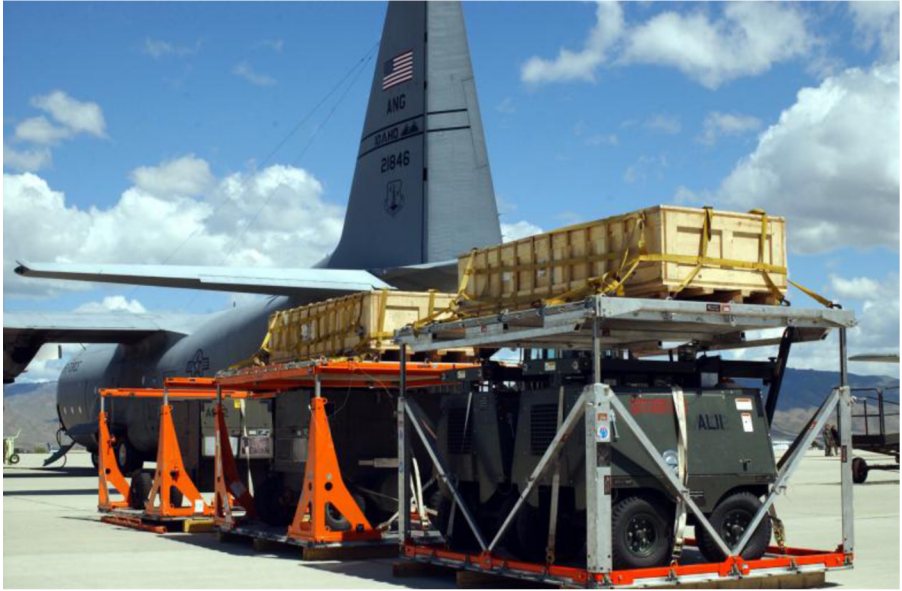
Plate 2. 4 PPs consolidated to 2 PPs using BALS