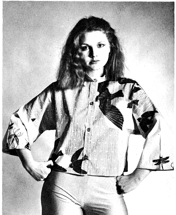
Graham Bezant, Toronto Star