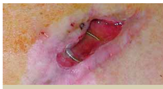
FIGURE 1: The pacemaker wound

The only treatment for this is complete, not partial, pacemaker system explantation or extraction, i.e. of the pacemaker and entire lead. Partial removal will not eliminate the problem. Cutting the pacemaker lead short, first and most importantly achieves nothing because although the local wound site may appear to heal, it does not eliminate the risk of systemic infection, for which the nidus is the bacteria harboured under the pacemaker lead insulation, and secondly, is contraindicated if percutaneous lead extraction is to be attempted. Prior to attempting lead extraction, cardiac imaging for vegetations is needed. It is recommended that if vegetations related to the pacing lead are larger than 10mm, surgical removal is needed, as in this patient with on-pump open heart surgery.