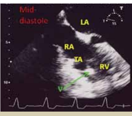
FIGURE 2: The transesophageal echocardiogram in various phases of the cardiac cycle showing the large echobright mobile density, the vegetation (V), which was attached to the pacing lead, prolapsing in and out of the right ventricle (RV). (Abbreviations: RA=Right atrium, LA=Left atrium, TA=Tricuspid annulus)