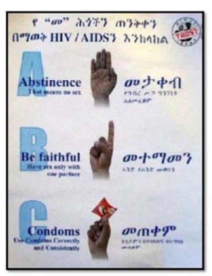
Figure 1: Example of posters that target the purple, red and blue worldviews (Brown and Beck 2009)

After three sets of posters were shown (with the same procedure of discussing it every time), the concept of worldviews was introduced and explained – specifically the three different worldviews the posters were tailor made for. The posters were shown again to the students, but this time with an indication of which worldview was targeted in each. Students could mark then