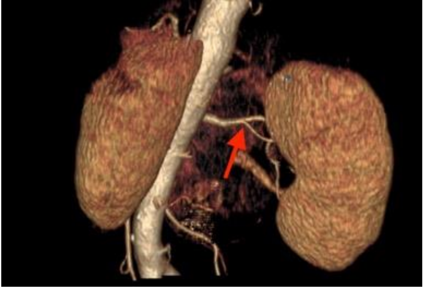
Figure 3. Prehilar branching of left kidney artery in computed tomography angiography image (Red arrow)