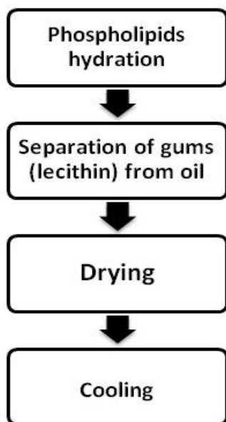
Fig. 2. Steps involved in the lecithin production (11).

There are different steps for the isolation of