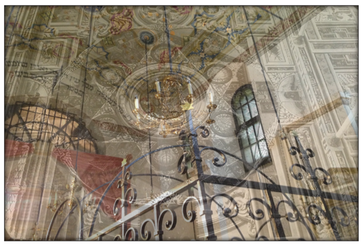
Shauna Rak (2015). Shelter. Digital assemblage.