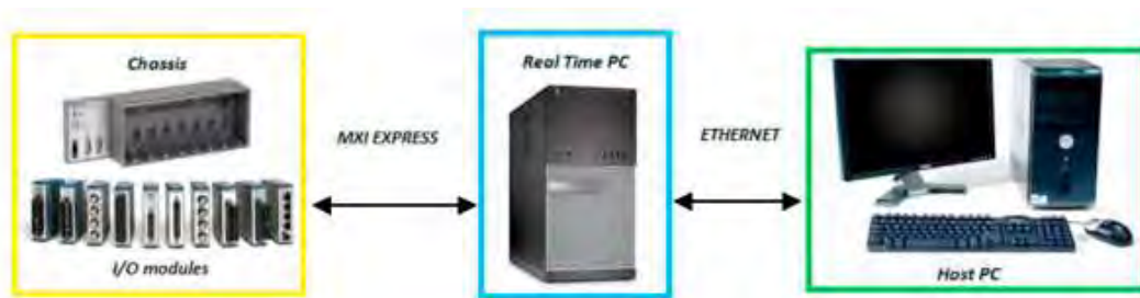
Figure 2.3 Control system structure