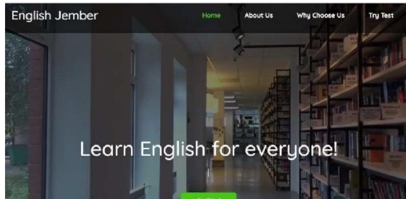
Figure 1. web-based