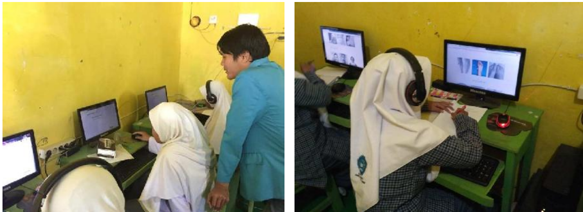
Figure 3. Implementation of English Jember Application in MA As-Shofa

The results of the pretest and posttest analysis showed increasing the learning outcomes of MA As-Shofa students. The average pretest result is 69,57 while the posttest result is 81,34. By looking at the average results, it shows increasing their ability in learning English. While the results of the questionnaire showed that MA As-Shofa students never knew and never used the software application in learning English. Instead, what they know is social media and online gaming. Therefore, they are very enthusiastic and motivated to learn English. The other results were shown after the researchers analyzed the questionnaire after English Jember application training. The results show that MA As-Shofa students can improve their English skills in vocabulary and pronunciation.