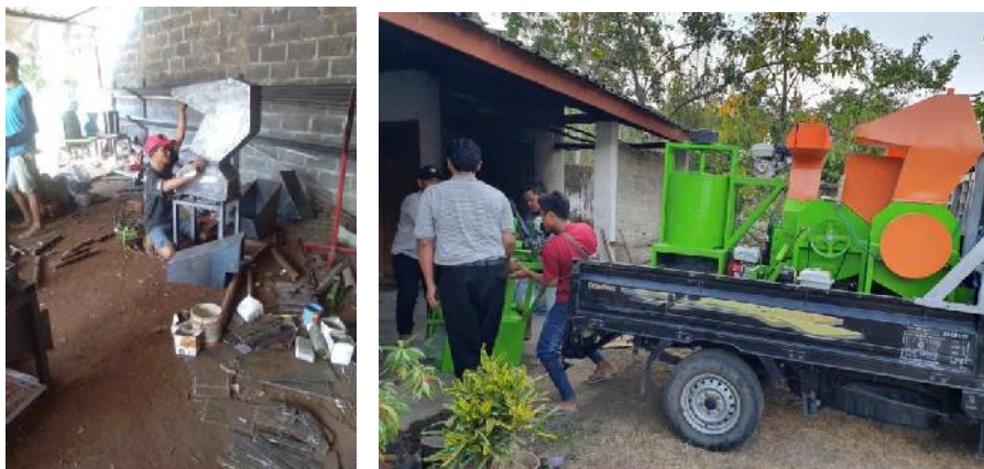
Figure 5. Waste processing technology including compost and plastic paving