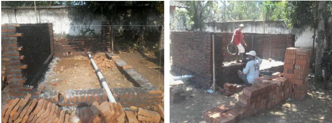
Figure 4. Material recovery facility for waste processing

community to collect waste to the waste bank. Waste that has no economic value has turned into compost for plant and agricultural seedlings and has generated profits from the sale of plastic waste and plastic paving products. Profits from selling rubbish can be exchanged for household or health needs. In addition, landfills in some places have been significantly reduced. Flood conditions in the Gambirano environment when the rain came began rarely because the water channel has been free from waste.