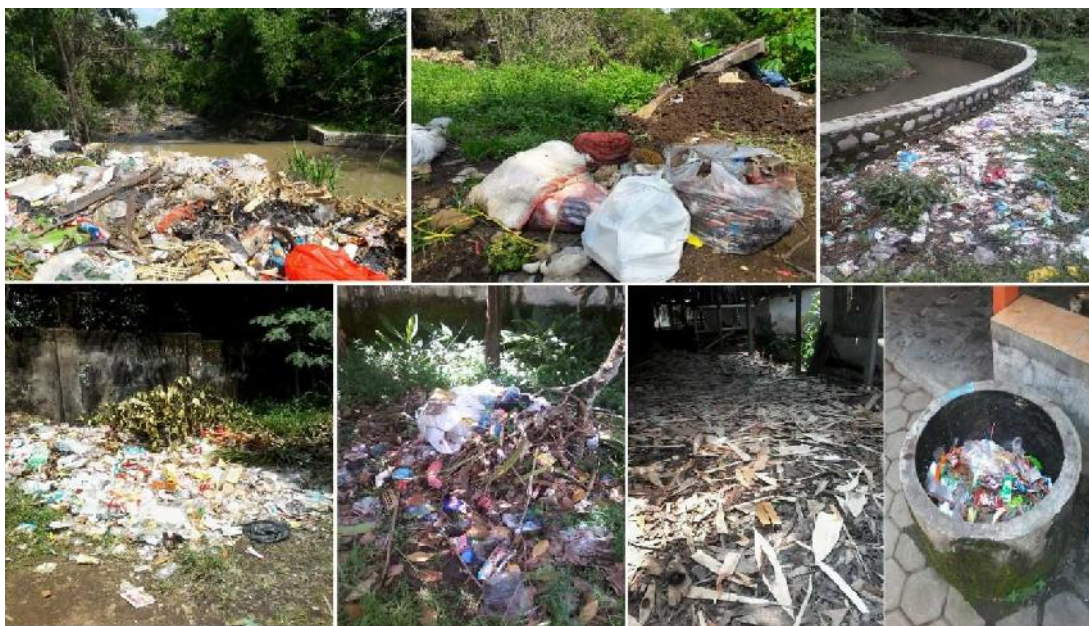
Figure 1. Dumping of waste at Gambirono sub-district, Jember

Gambirono sub-district is one of rural in Jember district, East Java, Indonesia facing waste management problem in which community environmental awareness is low. Many organic waste left over from agricultural products or wood processing is left scattered or stacked in the yard. The production of plastic and other inorganic waste from households, schools or industries is increasing, but because it does not have a landfill or waste processing, the garbage many are thrown into rivers, highways, yards or buried by making puddle of land for residents who own a yard. Environmental problems are occurred in Gambirono sub-district shown in Figure 1. In addition, flood conditions in the season rain has become commonplace due to piles of garbage clogging gutters, overflow of rivers due to siltation due to garbage. This is a source of dengue fever and diarrhea. There is standing water when it is raining community mobility to work because there are still many village road infrastructure unpaved or asphalt.