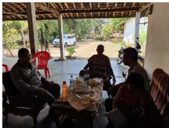
Figure 6. Dialogues and focus group discussion with local community at Gambirano sub-district