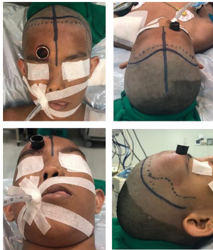
Image 6. Preoperative image of Patients