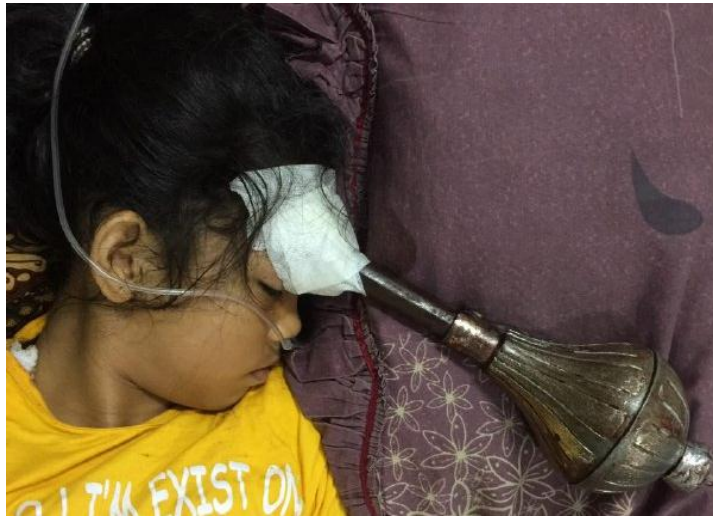
Image 1. Clinical Appearance of the Patient