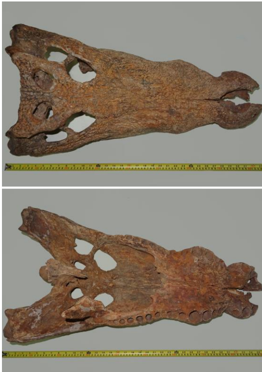
Figure 1. Dau Sau , the crocodile skull from Can Tho, with measuring tape from above (top) and below (bottom).

whipped its tail, flipped a boat, and took the bride away. The groom, anguished and furious, gathered many strong young people to capture the crocodile. After catching the crocodile, the groom cut it into pieces and threw them into the river to satisfy his anger. Wherever a piece of the crocodile was washed up, people named that part of the channel accordingly. The area where the skin was found was named Cái Da (skin), the area where the teeth were found was called Cái Răng (teeth), and the area where the head was found was called Đầu Sấu (crocodile head).