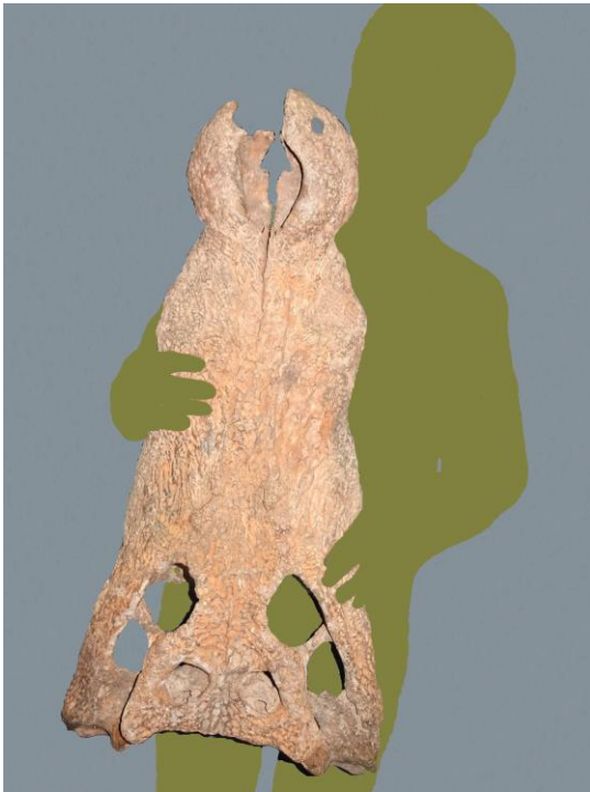
Figure 3. Held by one of the authors (Nguyen Thien Tao), the huge dimension of Dau Sau becomes apparent.