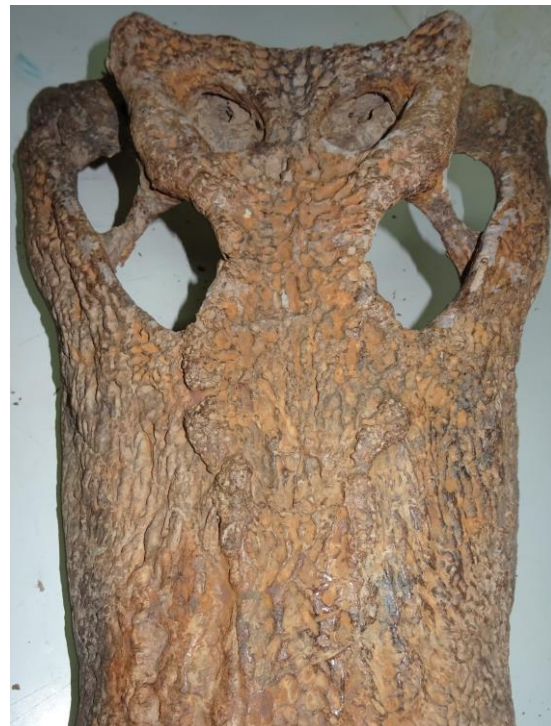
Figure 2. Two elongate ridges running from the orbits down the upper part of the snout are a characteristic of C. porosus and well discernible in Dau Sau, the crocodile skull from Can Tho.

two men” are found. His story continues that in the early years of the 20th century, there was a group of Chà people who were famous for hunting crocodiles. They helped to spear and kill a crocodile “as large as a five-plank-boat” - longer than 6 meters - in the Cái Răng River. Therefore, after capturing the crocodile, everyone was cheerful, gathered around to divide up the meat. Mr. Ut also reported that up until around 1940 he still saw people butchering crocodiles upstream of the estuary. Crocodile meat was transported from Nam Vang and An Giang to Can Tho by boat (e.g., Can Tho Online 2010). At that point, this area had already been called Dau Sau estuary/Dau Sau channel. In area 1 (An Bình ward nowadays) there is still an ancient temple named ông Vàm Dau Sau [translated as sir Dau Sau estuary; people usually refer to big animals respectfully as ông (which means sir or grandfather)].