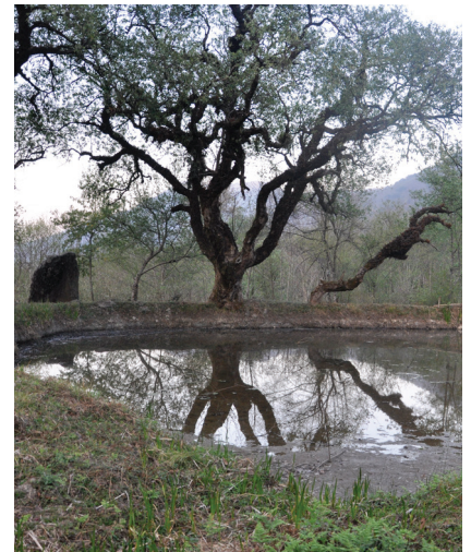
Fig. 3. A pond and a standing stone associated with the highest series of feasting, Khonoma.