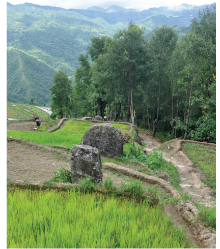
Fig. 2. Standing stones raised by the foot-path to the rice fields, Zapami.

In a European context, the megalithic discoveries of Western, Central and Northern Europe were first derived from the Mediterranean region. Due to the ex oriente lux orientation of European archaeology, which in the 19 th century and at the beginning of the 20 th century assumed a superiority of Oriental and East Mediterranean societies over Western non-written societies, the megalithic backgrounds of Neolithic societies had to be regarded as derivatives of “advanced civilizations” (cp. Renfrew 1973). Only by the attempts of fascist Nazi ideology to derive the Greek temples for ideological reasons from the Nordic megalithic tombs and due to the scientific dating from the 1960s, the ex oriente lux concept was shaken. In particular, Colin