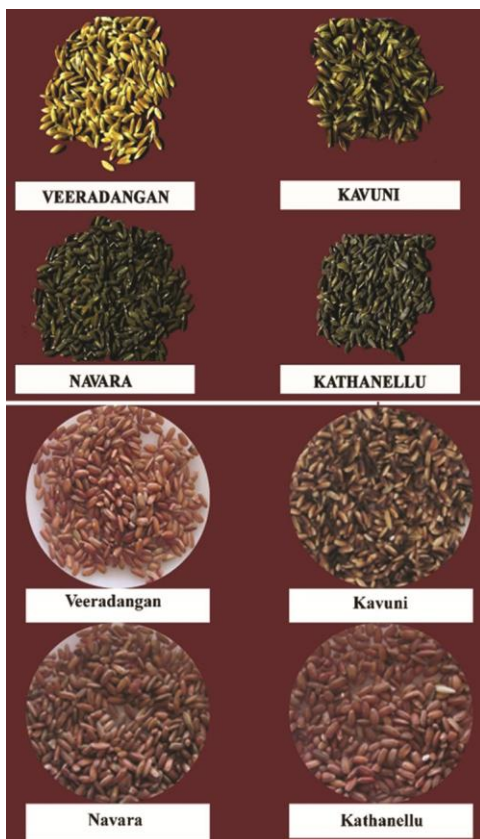
Fig. 1 — Seed Coat, Dehusked rice variation of land races in rice

Among the 20 single plants studied, plant 10 showed significant mean value for eight characters for five grain quality and three nutritional characters, plant 6 for six grain quality and two nutritional characters and plant 16 for eight grain quality characters (Fig 2). Plant 3, 11, 18 and 9 had