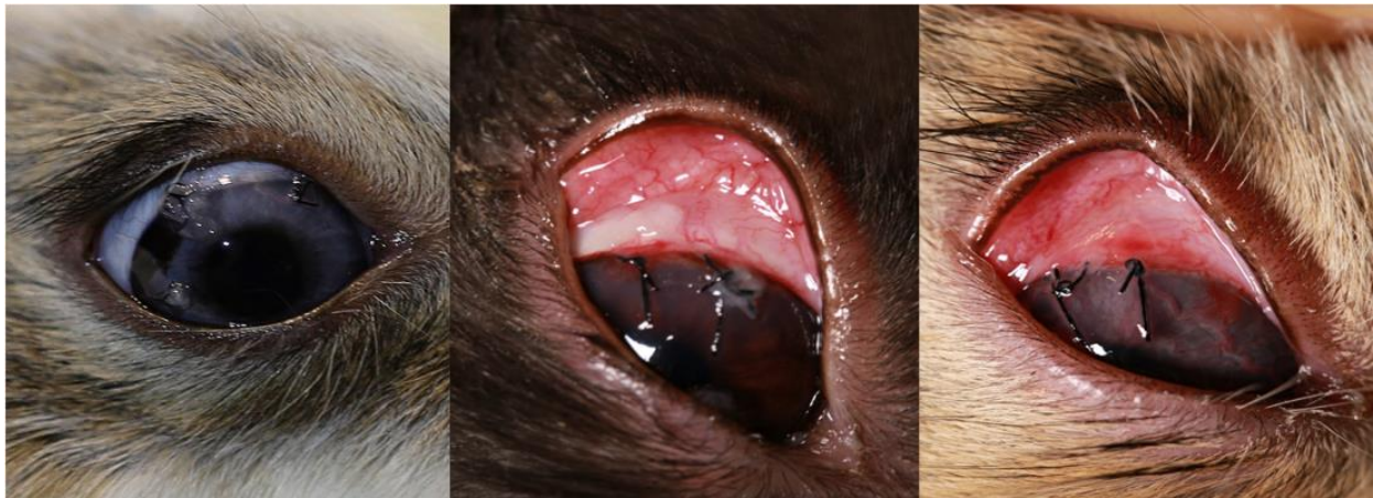
Figure 2: Control Group: 7 th , 21 st and 42 nd Days of Study; Significant Progression of Area and Length of corneal neovascularization (CNV) in 42 nd Day of Study.