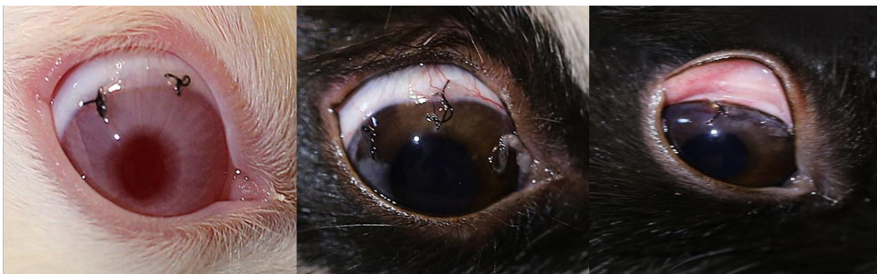
Figure 4: Timolol group: 7 th , 21 st and 42 nd Days of Study; Significant Less Progression of Area and Length of corneal neovascularization (CNV) in 42 nd Day of Study Compared to the Control and Propranolol Groups.