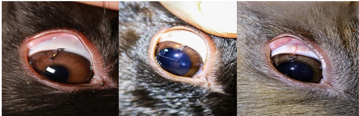
Figure 5: Bevacizumab Group: 7th, 21st and 42 nd Days of Study; Significant Less Progression of Area and Length of CNV in 42nd Day of Study Compared to Control and Propranolol Groups