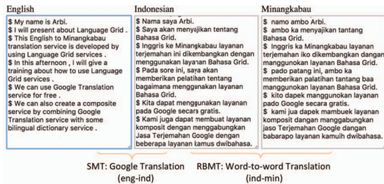
Figure 2. PHMT to Support Multilingual Communication.

* Scaled from 1 (Extremely Disagree) to 5 (Extremely Agree)