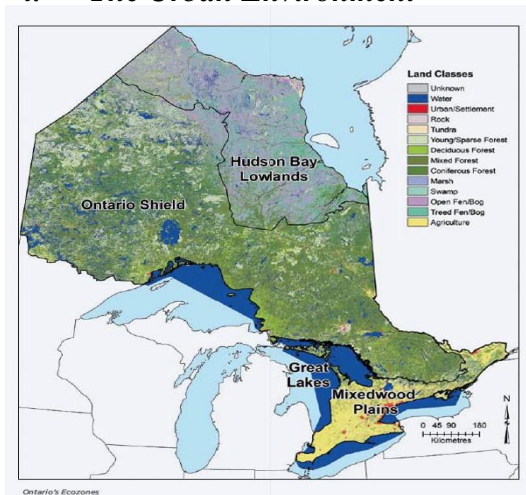
Figure 1: Ontario's 4 Ecozones.

Ontario is the second largest Canadian province next to Quebec. Having slightly more than 14 million residents, Ontario's population accounts for nearly 40% of the national population. Similar to the population distribution of the entire country, the majority of Ontarians live along the US-Canada border leaving a large portion of the province uninhabited (Statistics Canada). As is demonstrated in Figure 1, all 10 of the most populous cities in the province are located in its southern region near the US-Canada border (Lam and Conway, 644). While the population density of the province is 14.1 persons per square kilometer, 88.7% of the entire population lives within major metropolitan areas or census agglomerations (CA) while the remaining 11.3% of the population lives outside of urban areas (Statistics Canada). Furthermore,