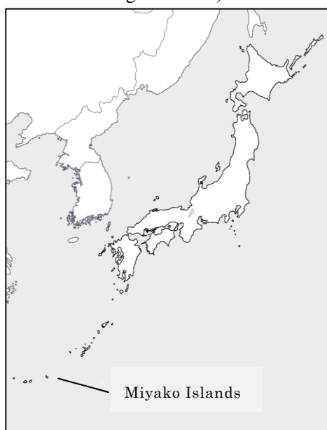
Map 1. Location of the Miyako Islands.

Tarama Village comprises Taramajima, with a surface area 19.75 km 2 and a population of 1,273, and Minnajima, with a surface area of 2.153 km 2 and a population of 6 (as of June 2012, according to the Tarama Village website).