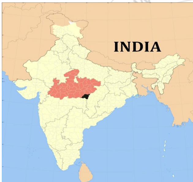
Figure 2.1: Location Map of district Balaghat, M.P, India

Copper (Cu) is considered as a micronutrient for plants (Thomas et al., 1998) and plays important role in CO 2 assimilation and ATP synthesis. Cu is also an essential component of various proteins like plastocyanin of photosynthetic system and cytochrome oxidase of respiratory electron transport chain (Demirevska-kepova et al., 2004). But enhanced industrial and mining activities have contributed to the increasing occurrence of Cu in ecosystems. Cu is also added to soils from different human activities including mining and smelting of Cu-containing ores. Mining activities generate a large amount of waste rocks and tailings, which get deposited at the surface. Excess of Cu in soil plays a cytotoxic role, induces stress and ROS (Stadtman and Oliver 1991). Oxidative stress causes disturbance of metabolic pathways and damage to macromolecules (Hegedus et al., 2001). Copper dust had adverse effect on photosynthesis pigmentations of vegetation around the mining site (Pichhode & Nikhil, 2015 a) with soil and vegetation cumulatively on certain vegetation of district Balaghat, M.P (Pichhode & Nikhil, 2015 b). Excess application of pesticides had resultant in the rise of Cu in soil (Nikki, 2000).