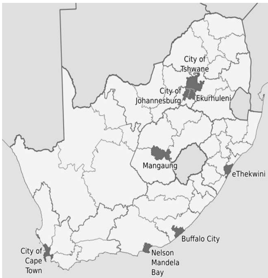
Figure 1: Metropolitan areas as of 2011