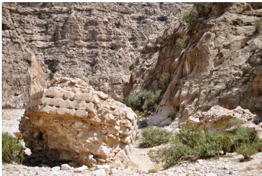
Fig. 2 - Remains of a pier of Mehr-Narseh's bridge on the Tang-ab River, Firuzabad County, Fars Province.