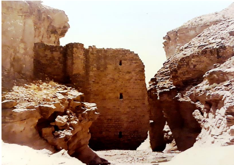
Fig. 5 - Panoramic view of the Gompu dam in the Gerash County, Fars Province (after Askari Chaverdi 2013, fig. 73).