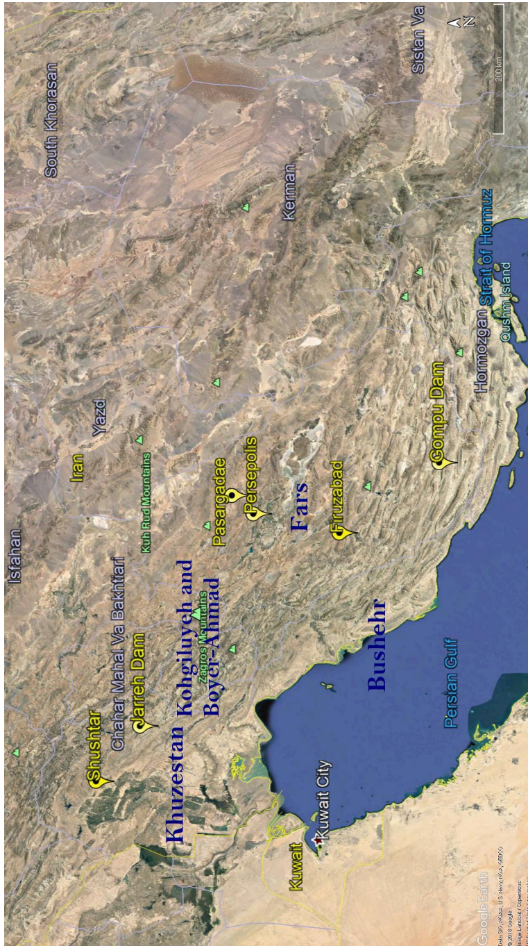
Fig. 1 - Map of South-western Iran showing the location of major archaeological sites mentioned in the text