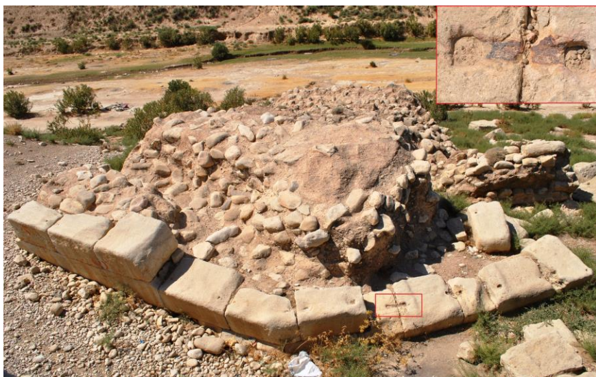
Fig. 3 - Remains of a pier of the ancient bridge located west of Ardashir-Xwarrah, Firuzabad County, Fars Province; in the red frame: detail of a socket with traces of a metal clamp joining two cut-stone blocks (photo by the author).