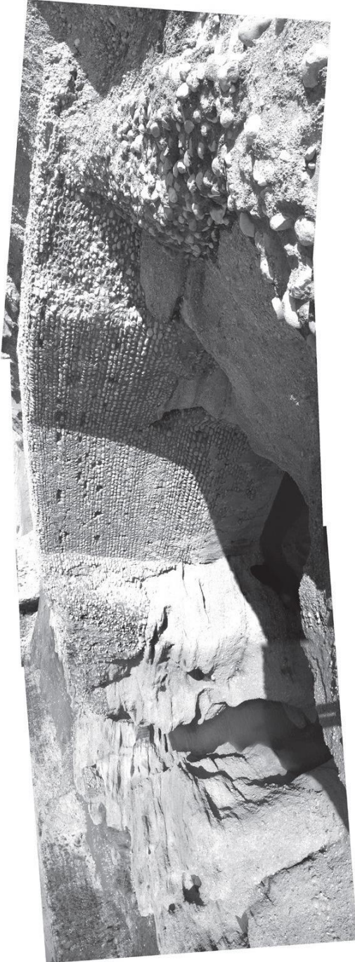
Fig. 4 - Panoramic view of the Jarreh dam in the Ramhormoz County, Khuzestan Province (after Sharifi 2018, fig. 9).