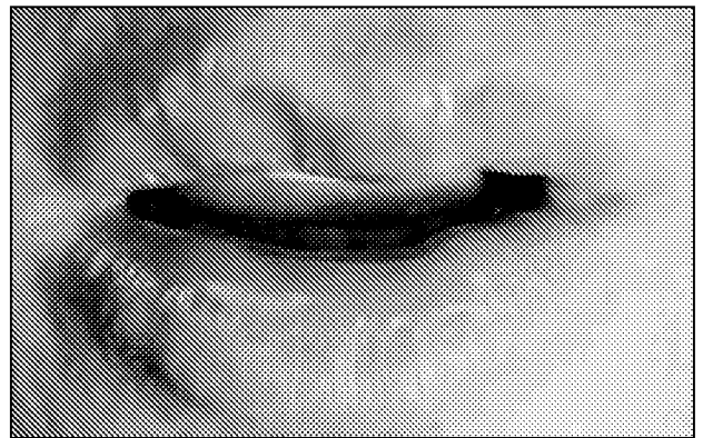
Figure 1: Recurrent herpes labialis in the vesicle stage.

In recent years, major progress has been made in our understanding of HSV infections, and in the development of safe and effective antiviral drugs. Nucleoside analogues that inhibit HSV replication are available commercially for the treatment of herpetic keratitis, herpes genitalis, herpes labialis, mucocutaneous HSV infections in immunosuppressed hosts, neonatal herpes and herpes encephalitis. In the following report, the status of topical and peroral treatments for herpes labialis given either 'episodically' (at the onset of a recurrence) or chronically in the absence of lesions to prevent recurrences (prophylaxis) are reviewed.