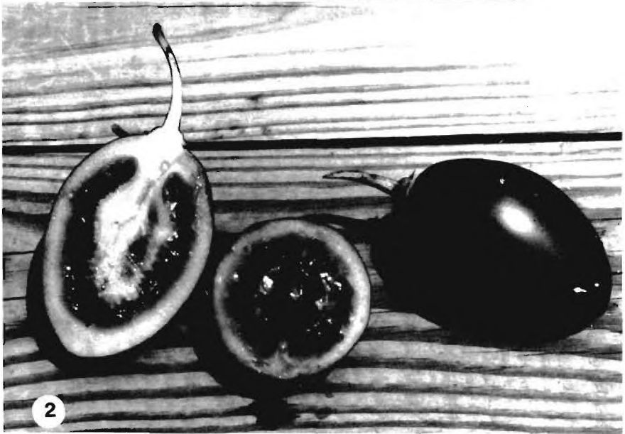
Fig. 1-2. Cyphomandra betacea . Fig. 1. Plant growing at Baños, Prov. Tungurahua, Ecuador. Fig. 2. Fruits.