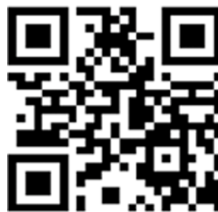
Jeanne Le Ber