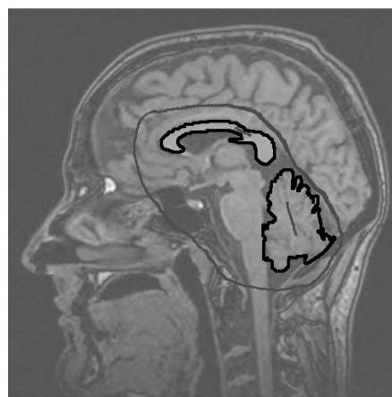
Fig. 1. Example of the multilabel segmentation obtained from the algorithm of [3]. Gray marks represent the result of user interaction ( i.e. , seeds) to indicate three objects (corpus callosum, cerebellum and background). Thick black lines indicate the computed segment boundaries. Even though no prior knowledge is built into the algorithm to find a particular object, the algorithm correctly segments both objects, despite unusual shapes and textures.

A multigrid approach was applied by Acton [1] to the similar problem of anisotropic diffusion. His approach employed a simple injection restriction operator and a traditional interpolation prolongation method to prevent smoothing/restriction across edge boundaries. The formal relationship and relative advantages of our approach will be discussed in Section 4.