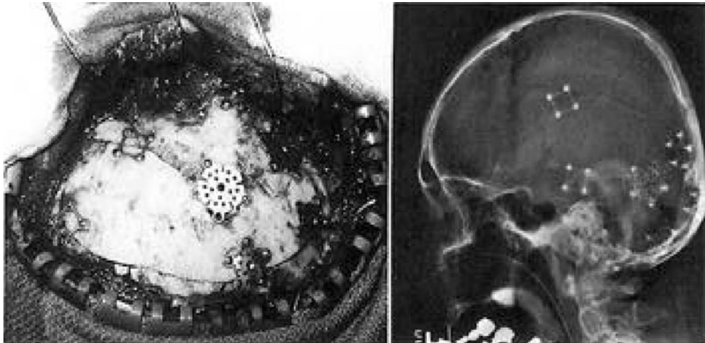
FIG. 2. Left: Intraoperative photograph demonstrating the use of the miniplate system for fixation of the bone flaps. Note that replacing the outer table of mastoid bone buttresses the fat graft placed in the drilled mastoid cavity below. Burr holes are covered with titanium burr-hole covers. Right: Postoperative skull radiograph showing the bone flaps and various miniplates used for fixation.

der of the mastoidectomy is then performed with a high-speed burr. Upon closure, the outer table of mastoid bone is replaced over a fat graft to the mastoid defect and dura, with tamponade of the fat graft to minimize CSF leaks. This outer-table bone flap is fastened in place with miniplate fixation (Fig. 2).†