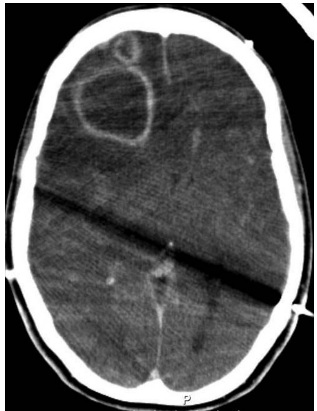
FIG. 2. Contrast-enhanced CT scan of the head demonstrating two low-density ring-enhancing lesions in the right frontal lobe.

1950s to obtain cervical spinal stabilization. While providing immobilization with maintenance of reduction to achieve healing from a fracture or reconstruction, halo devices allow early mobilization and a shorter hospital course for the patient. 15 As with every procedure, however, there are inherent risks involved in the use of halo orthoses.