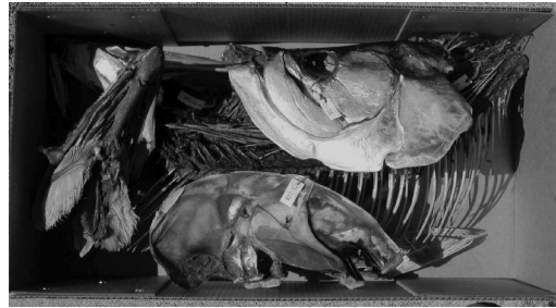
Fig. 2. A partially articulated specimen of a large Atlantic tarpon, Megalops atlanticus , in a suitable box ready for the dermestid colony. Each piece has a tag with specimen's field number. This specimen was prepared using the Ridewood dissection method; the inner surface of the right cheek and jaws is visible below and the gill arches can be seen on the left.

Once the gill arches have been removed from the specimen, it is easy to complete a Ridewood dissection. Beginning at the posterodorsal corner of the right operculum, cut the muscles linking it to the skull. Then work forward to separate the right hyomandibula from its articulation with the otic region of the braincase (work the joint back and forth to help loosen this articulation). Cut the symphysis between the left and right lower jaws and carefully cut between the left and right premaxillae. Continue this last cut into the oral mucosa, separating carefully between the right palatal bones and median structures such as the vomer and parasphenoid. Work the joints between the palatal