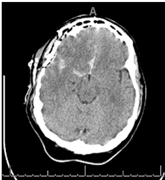
Figure 2: Postoperative axial computed tomography scan showing subarachnoid blood in the basal cisterns and particularly in the right sylvian fissure.