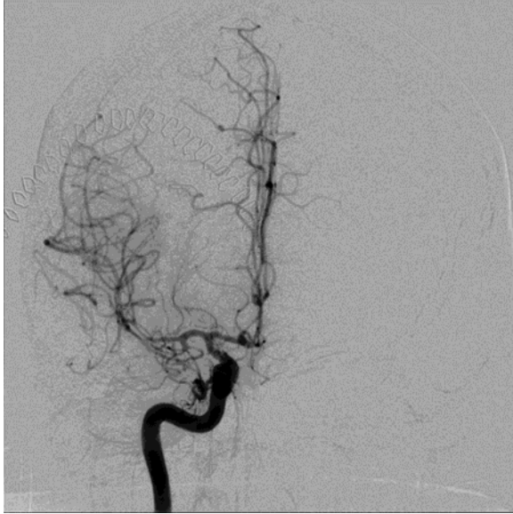
Figure 5: Cerebral angiography after intra-arterial infusion of 25 mg of verapamil into the right internal carotid artery showing improvement of cerebral vasospasm in the affected segments.