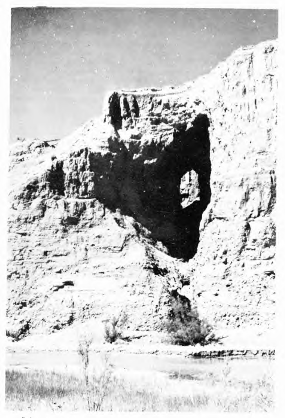
FIG. 2. Kanab Creek and Wash about 3 miles south of Kanab showing an crossional cavern utilized as a roosting site by barn owls. Photographed by William H. Behle, June 18, 1947.