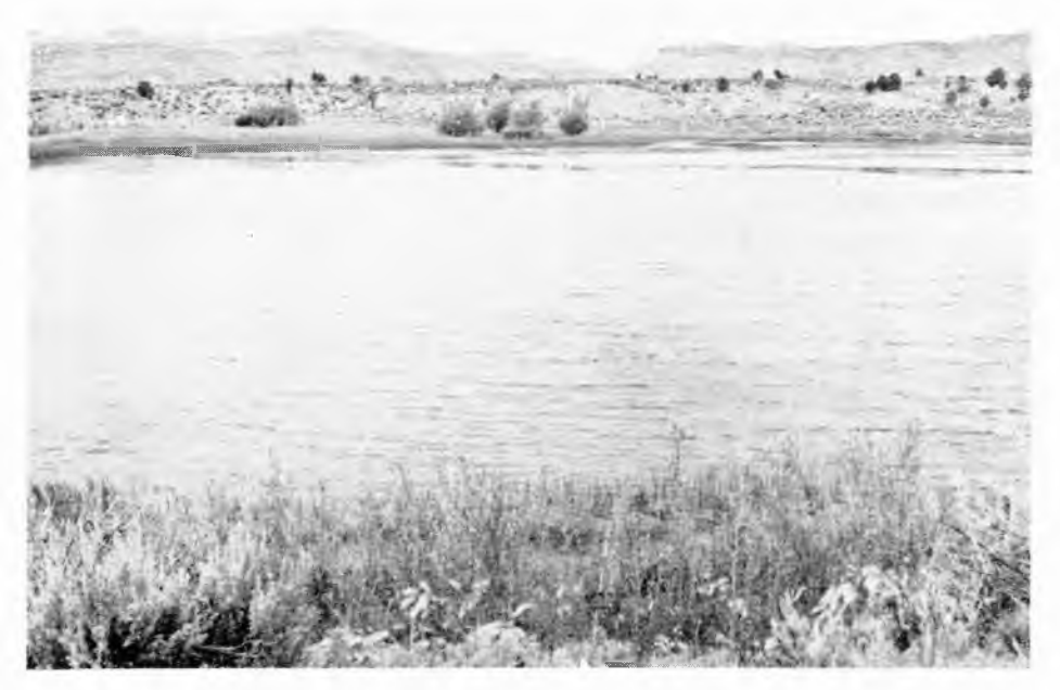
FIG. 4. Lower Reservoir about 3 miles south of Kanab with marsh area along the northwest shore. Here most of the transient water and shore birds were seen. June 18, 1947.

misia tridentata ). In some areas where the soil factors are suitable the spineless horsebrush ( Tetradymia canescens inermis ) becomes dominant along with the sagebrush. This belt ranges in elevation from about 7200 feet to 9500 feet.