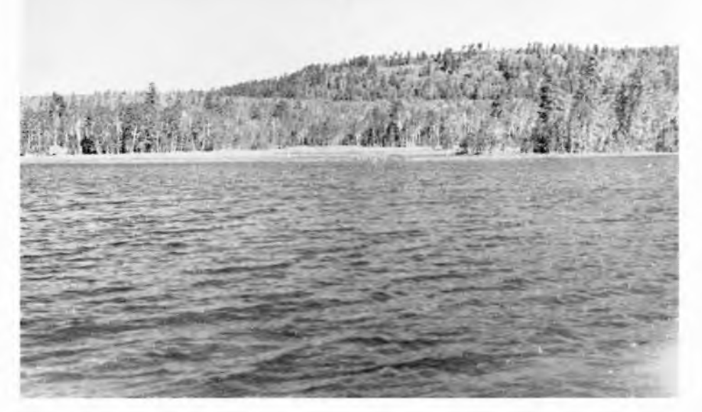
FIG. 5. Duck Creek reservoir. 8555 feet elevation. with aspen-spruce-fir forest in background. Photographed by William H Behle, June 18, 1947.

Sagebrush. — Considerable overlap exists between this formation and the preceding. Indeed they might well be lumped as a northern desert shrub formation except that extensive pure stands of sagebrush occur in some places and sage extends to higher elevations than the desert shrub being especially common in the pinon-juniper belt, in the clearings in the coniferous belt and upon the slopes of the higher unforested regions as high as 10,000 feet. It is also