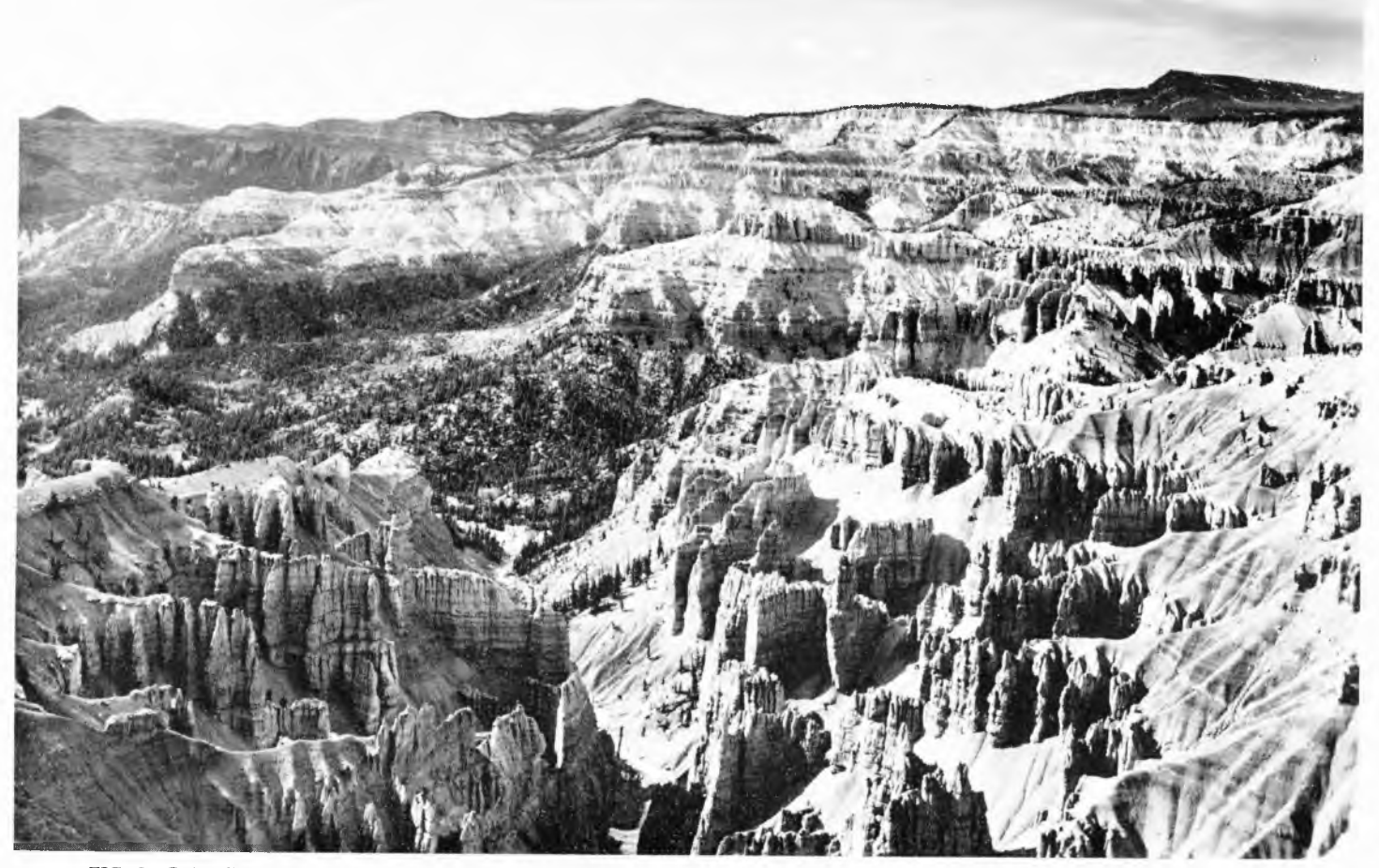
FIG. 8. Cedar Breaks National Monument showing rim at about 10,700 feet elevation, erosional formations and subalpine coniferous forest. On extreme right is Brian Head. The summit at 11,315 feet is above timber line.