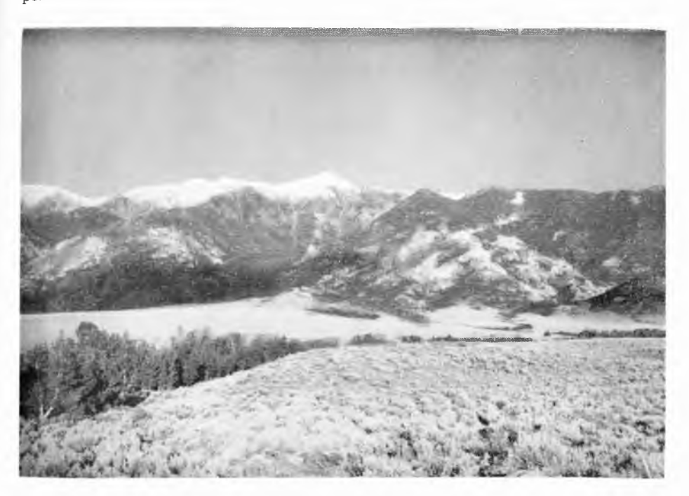
FIG. 1. West side Deep Creek Mountains with Mt. Ibapah. 12.101 feet. in center. Note timber line, the spruce-fir forest at upper elevations, the mountain mahogany and pygmy forest belt near the base of the steep slopes, the extensive sagebrush at lower elevations and the streamside deciduous vegetation extending out into the sage area. Photograph taken September 15, 1947.

In furtherance of a long-time survey of the avifauna of Utah the Deep Creek Mountain region of the central western part of the state was chosen as an area for intensive study. It was expected that gradients would occur in the characters of geographically variable birds between populations from the isolated ranges of the Great Basin and birds from the Wasatch Mountains to the northeast, those mountains that form the abrupt eastern margin of the Great Basin or the high plateaus of central and southern Utah. The Deep Creek region seemed most propitious for collecting a representation of the Great Basin races. While the analysis of the geographical variation was the main objective of the study and large series of the variable birds were desired. in accord with the general practice of making avifaunistic studies of particular regions, samples of other birds were taken when possible, and a study was made of the ecology of the birds of the region. Although the emphasis was on collecting, attention was paid to abundance, behavior, and life history features. as opportunity was afforded. Working out the details of the variation throughout Utah must await the accumulation of additional material from many other locations, but in the meantime the results of the Deep Creek Mountain survey may well be placed on record to reveal the nature of the avifauna of this portion of Utah.