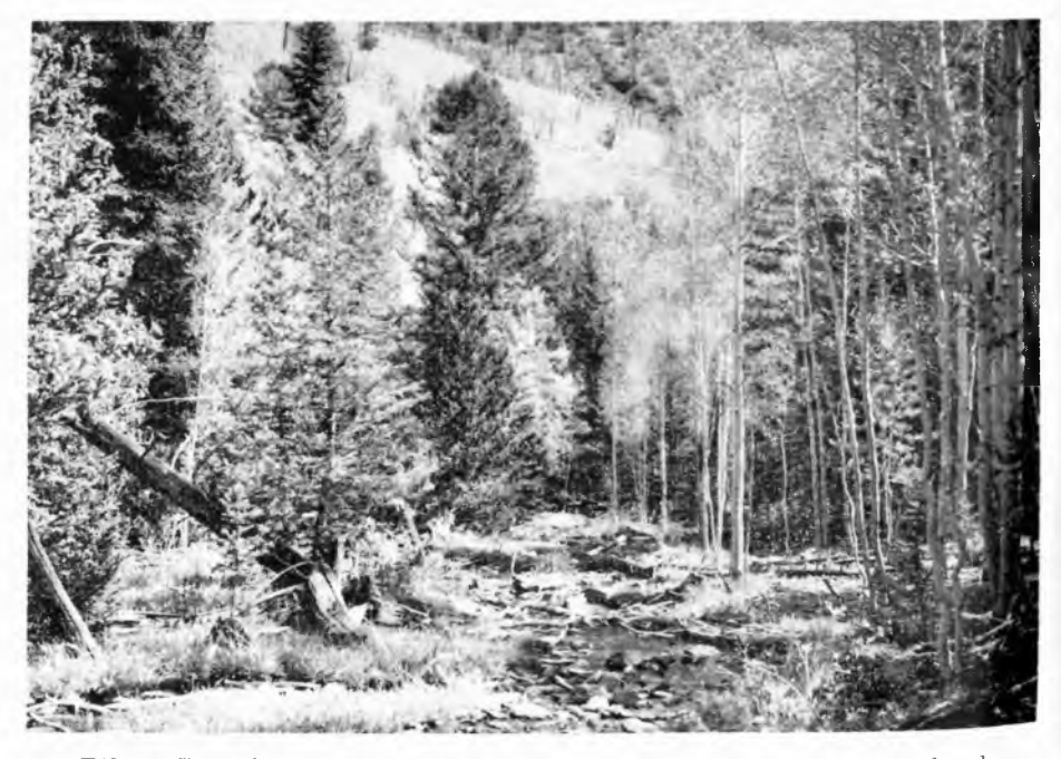
FIG. 4. Trout Creek, east side Deep Creek Mountains. The principal birds found in this type of environment were the Dusky Grouse, Hammond and Wright Flycatchers, Wood Pewee, Steller Jay, Mountain Chickadee, Red-breasted Nuthatch, House Wren, Hermit Thrush, Ruby-crowned Kinglet, Audubon Warbler, Grayheaded Junco. Photograph taken September 7, 1947.

GEOLOGY. The geology of the Deep Creek Mountains has been studied by Reagan (1929) and Nolan (1935), the former being more concerned with the high southern portion, the latter concentrating on the more heavily mineralized northern end in the Gold Hill area. The geology as well as the geography and physiography of the region is also discussed by Butler (1920:469-486). There are three structural divisions of the range. The northern one is made up chiefly of metamorphosed sedimentary rock of Paleozoic age. It averages 8,000 feet in elevation. The central portion is approximately eight miles long, seven miles wide and averages 11,000 feet in elevation. It is almost entirely of granite. The southern portion of the range is composed principally of quartzite and shistose quartzite and has an average elevation of 9,000 feet along the crest. There is evidence of glaciation in the Deep Creek Mountains, the glaciers evidently coexisting with Lake Bonneville. Cirques are well marked at the bases of Mt. Ibapah and Bald Mountain and both lateral and terminal moraines are discernible at several of the steep canyons.