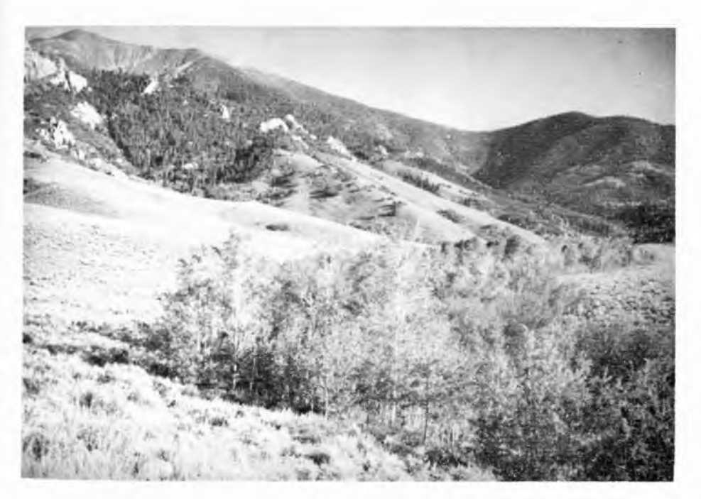
FIG. 3. Fifteen Mile Creek and the Queen of Sheba Mine area with its variety of habitats. Photograph taken September 15, 1947.

On the east side of the mountain the streams quickly disappear into the alkaline desert. There are only two sparsely populated hamlets here. Callao is located in the desert at some springs near the Juab-Tooele County line, 4,326 feet. Trout Creek, 4,679 feet, is near the south end of the range on the east side. The next mountain to the east of the Deep Creek Mountains is the Fish Creek range. This is a much lower, drier and less diversified mountain. At its base on the northeast side are the Fish Springs where brackish water bubbles up from sandy pools and flows out to form channels, pools and a marsh that covers several miles before the water is dissipated in the Great Salt Desert to the north and east. Near the north end of the Deep Creek range is the nearly abandoned mining town of Gold Hill (5,321 feet). On the west side of the Deep Creek Mountains is Deep Creek Valley with Deep Creek