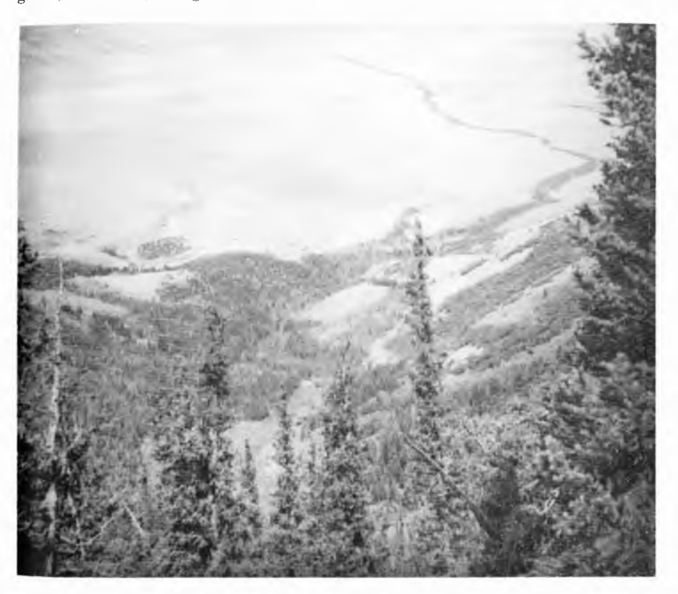
FIG. 5. Looking down Fifteen Mile Creek from the summit of the Deep Creek Mountains showing the steep slope and tongue of streamside vegetation extending out into desert area at the base of the mountain. Photograph taken August 7, 1947.

MARSH. The most extensive marsh in the area which we visited is that at Fish Springs. The vegetation consists of tules, rushes, spike rush, arrow grass, milkweed, salt grass, and a few cattails were observed. Here a number