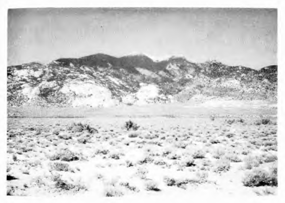
FIG. 2. East side Deep Creek Mountains showing granite dome and belting of vegetation. In the foreground is the desert shrub community. Photograph taken September 7, 1947.

A three day trip to the region was made from May 12 to 14, 1950 by Richard Porter, Robert Draper and the writer. The first day was spent around Ibapah. On the 13th a reconnaissance was made up Pass Creek, following