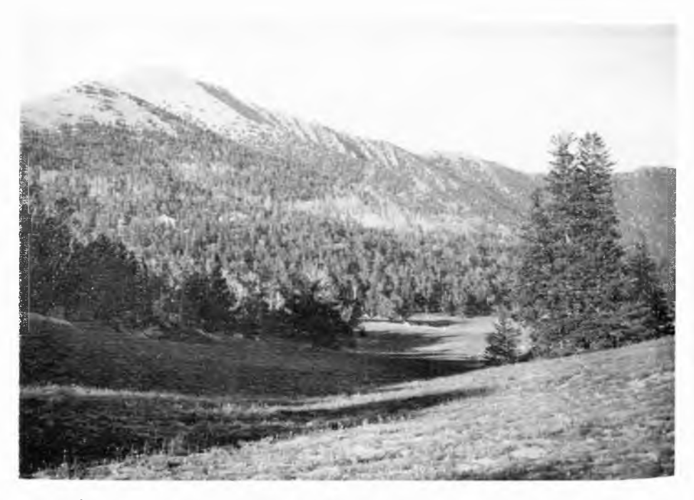
FIG. 7. Divide south of Mt. Ibapah which is shown on left. Clark Nutcrackers were common here. In the fall chickadees and juncos occurred right up to timber line. Photograph taken August 7, 1947.

MONTANE RIPARIAN AND CANYON FLOOR WOODLAND. Although somewhat similar in general aspect to the streamside community of the valleys and desert regions, the component vegetative forms are different from about 6,500 to 8,000 feet and a different assemblage of birds occupies the community. Willows are represented by the species ( Salix lutea , S. scouleriana and S. pseudocordata ) and they occur in scattered clumps. The cottonwoods are replaced by aspens ( Populus tremuloides ). Other plants that occur extensively here are red river birch ( Betula fontinalis ), Chokecherry ( Prunus virginianus ) and wild rose ( Rosa woodsii ). This community extends to lower elevations along the streams forming tongues out into the surrounding sagebrush of the dry slopes. A gradual transition occurs to the valley type of streamside community.