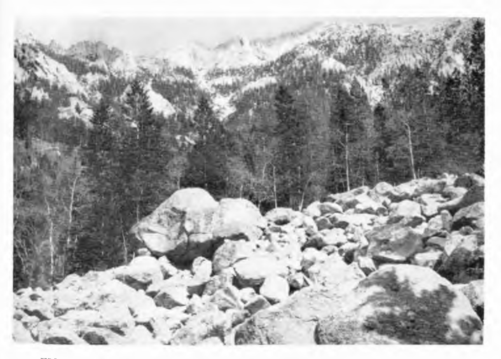
FIG. 6. Steve's Canyon. Mt. Ibapah in background and showing the character of the spruce-lir forest. Up to about 8.000 feet white fir and aspens are predominant while from 8.000 feet to timber line, alpine fir and Engelmann spruce occur. Photograph taken August 11, 1947.

Virtually confined to this habitat are the following birds: Gray Flycatcher, Scrub Jay, Piñon Jay, Plain Titmouse, Lead-colored Bush-tit, Blackthroated Gray Warbler. Occurring here frequently but ranging widely were: Mourning Dove, Booming Nighthawk, Common House Finch, and Chipping Sparrow.