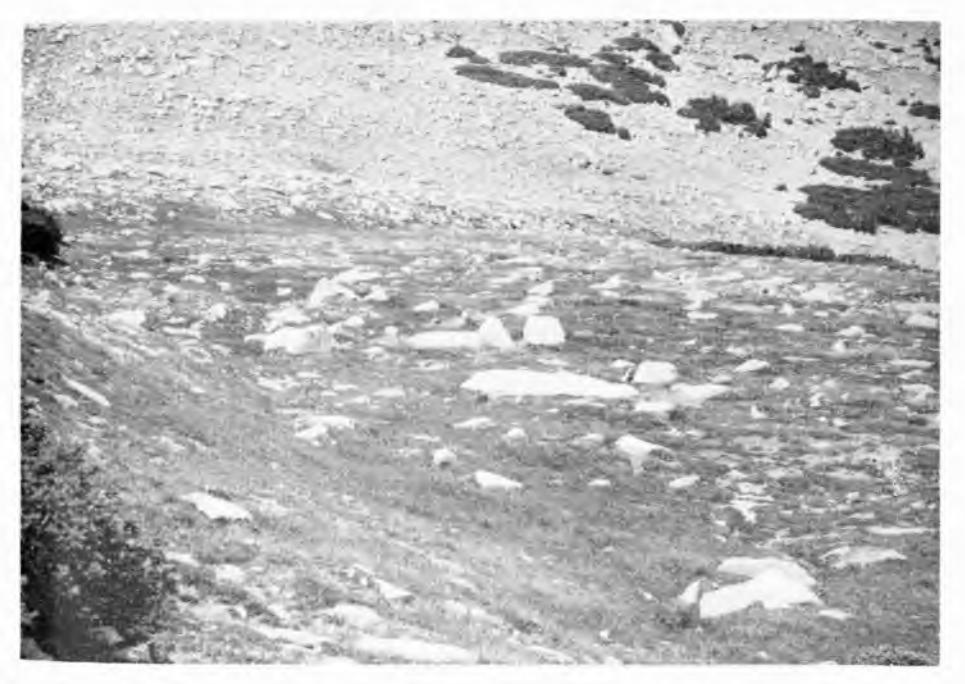
FIG. 8. Moisture area at head of Red Cedar Canyon at base of Mt. Ibapah. Pipits occupied this habitat and the alpine tundra above timber line. Photograph taken August 7, 1947.

On the basis of the differing elements of the principal vegetative type and associated changes in the fauna some students of ecology have found